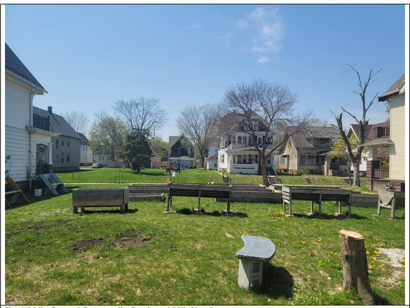
The Middle Ground Community Garden at 39th Street

The Middle Ground, Inc. , a community organizing endeavor committed to supporting neighborhood improvement.