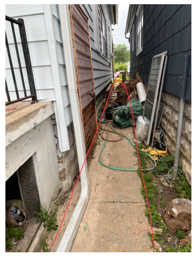
Replace 60'\ X\ 3' side wall (this most include any stairway, window or curbs