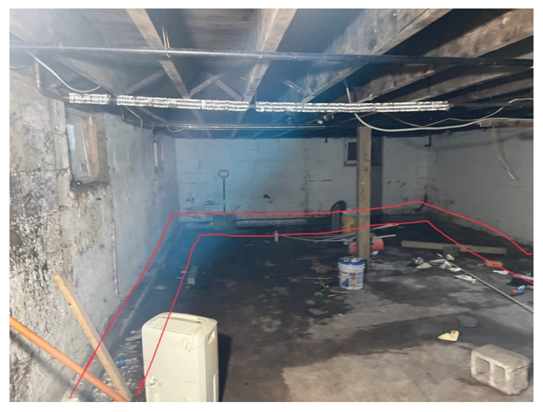
Install 100' of drain tile along 3 walls, including a Bucket well and sump pump with a 2" pvc pipe