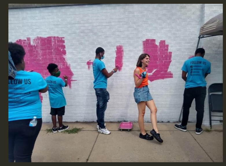
Artists Working in Education members beginning work on a community-based mural, 2021

Budget - The total budget for the Artist Services for the Public Artist in Residency pilot is $43,000 in Artist fees, including reimbursable expenses, and $25,000 for all costs associated with the development and implementation of the project.