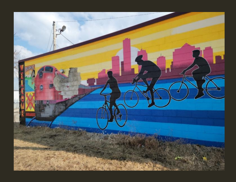
$3,000 for the Riverworks Development Corporation Beerline Trail Train Mural conservation