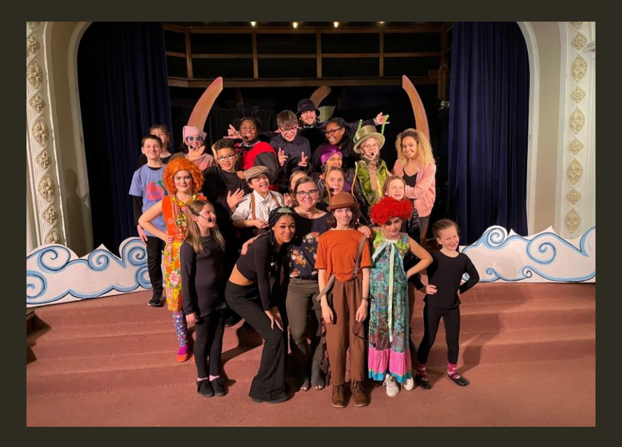
Cast & Crew Members of Milwaukee Youth Theater's production of James and the Giant Peach, 2022