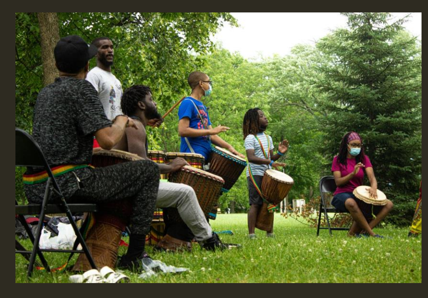
Ko-Thi Adult Ensemble and Ton Ko-Thi Musicians welcome community members at Ko-Thi Around Milwaukee in Sherman Park, 2022