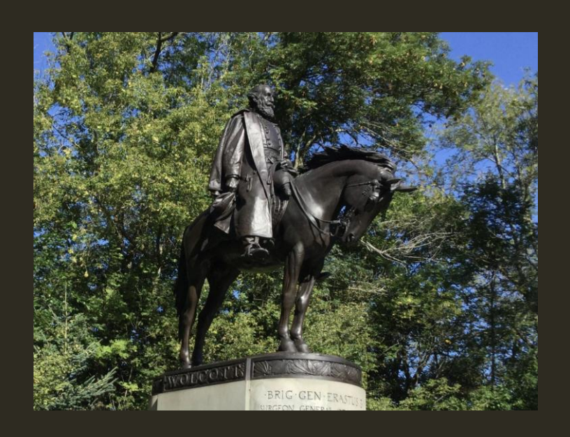
$2,000 for the Lake Park Friends conservation of the Erastus Wolcott Memorial