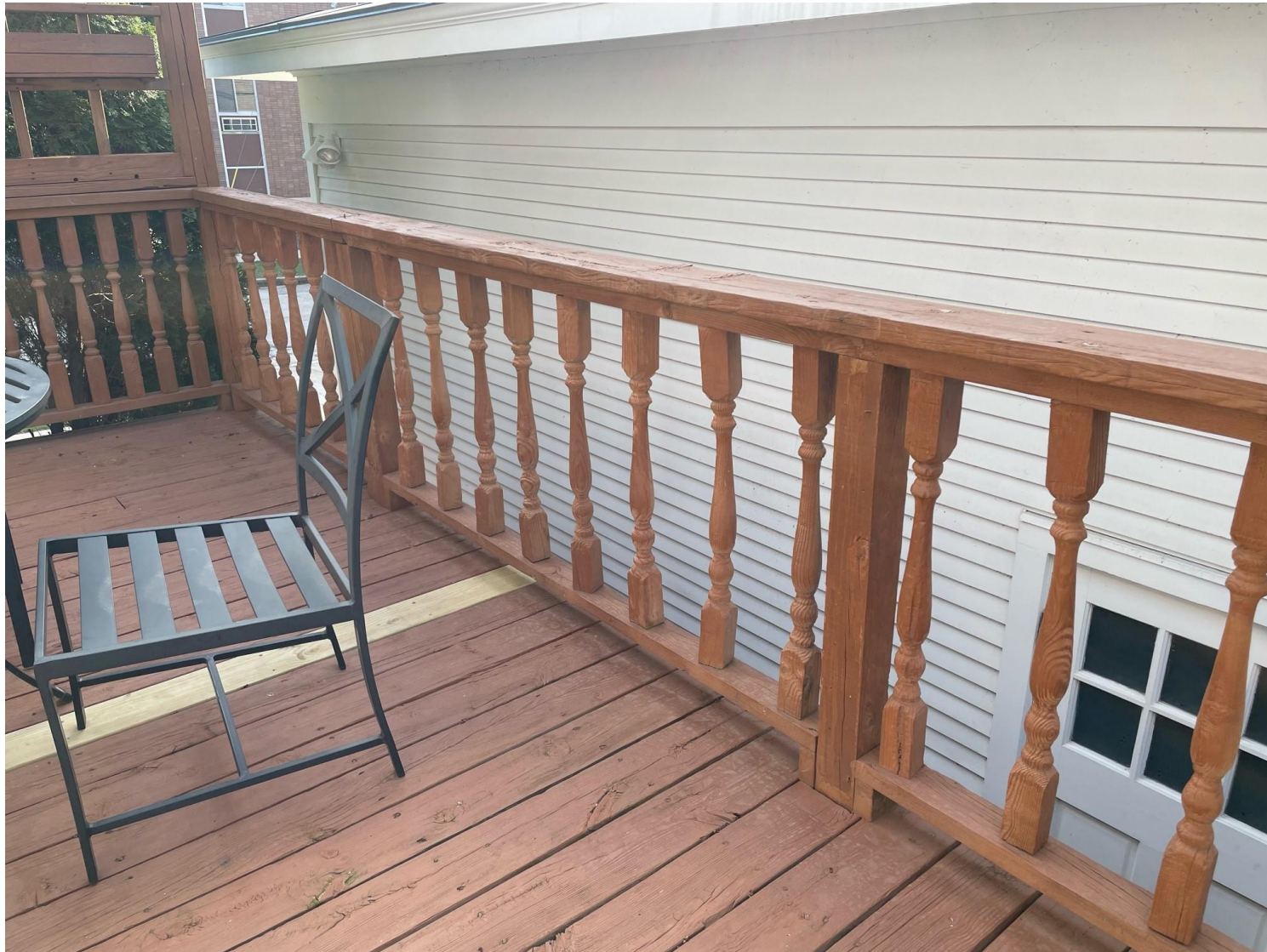
Existing balusters and rails to be removed