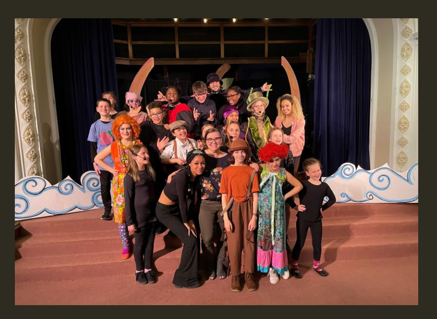
Cast & Crew Members of Milwaukee Youth Theater's production of James and the Giant Peach, 2022