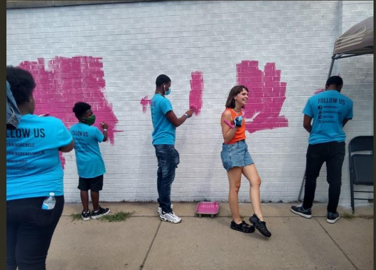
Artists Working in Education members beginning work on a community-based mural, 2021

Budget - The total budget for the Artist Services for the Public Artist in Residency pilot is $43,000 in Artist fees, including reimbursable expenses, and $25,000 for all costs associated with the development and implementation of the project.