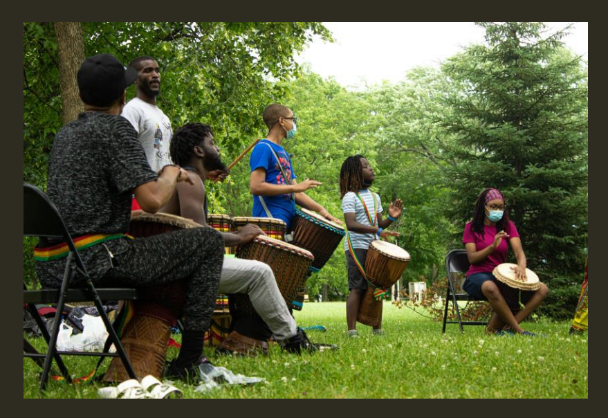
Ko-Thi Adult Ensemble and Ton Ko-Thi Musicians welcome community members at Ko-Thi Around Milwaukee in Sherman Park, 2022

- 214,743 people were served (audience members, gallery attendees, zoom views, listeners, etc.)