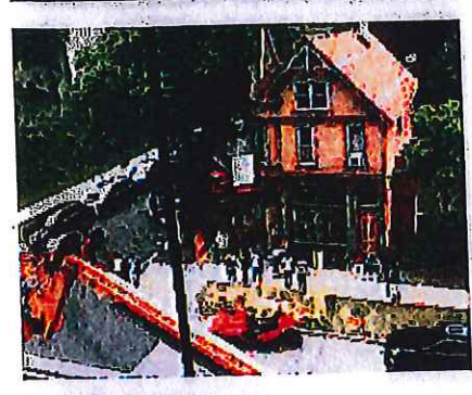
D.JPG ' 2969K