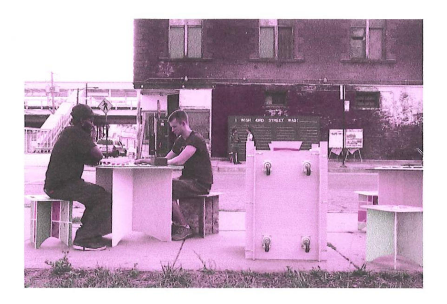
Depiction of the "I wish 43rd street was" project in Chicago, created by the Illinois Institute of Technology