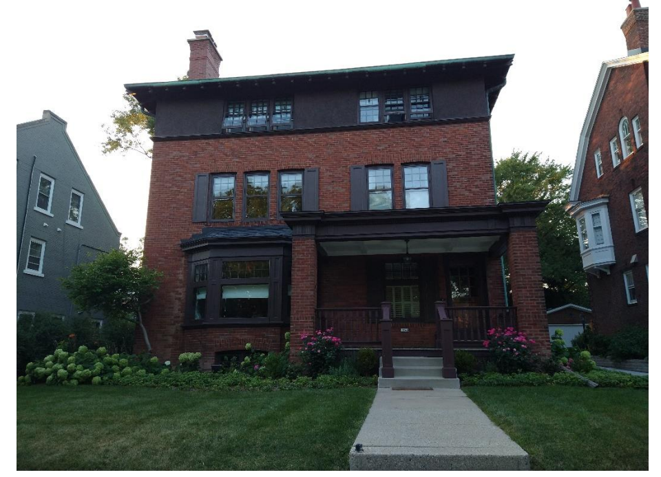
City of Milwaukee Historic Preservation Staff