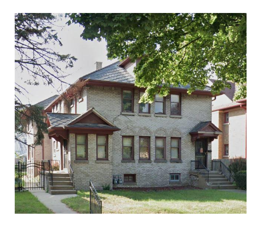
3129 N. Sherman Boulevard