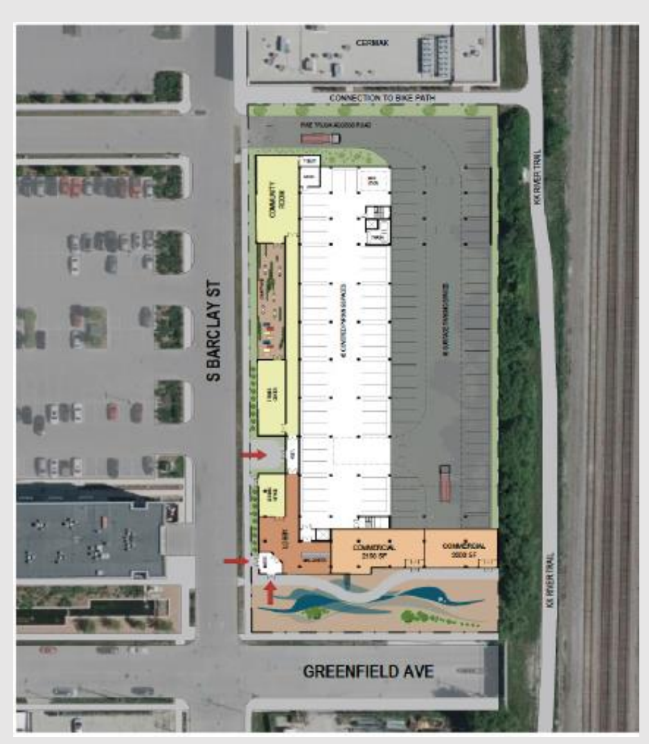
Rule Enterprises Proposal for Freshwater Plaza Ground Level