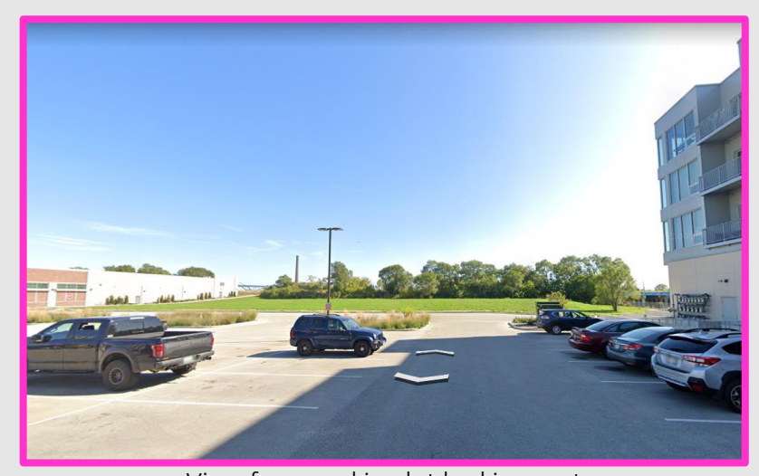
View from parking lot looking east