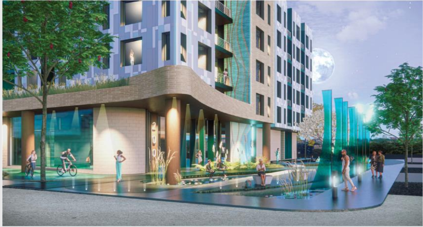
Rule Enterprises Proposal for Freshwater Plaza