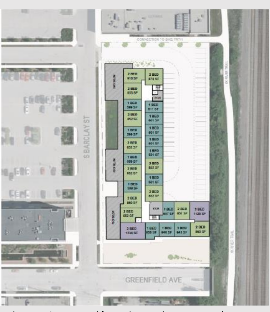
Rule Enterprises Proposal for Freshwater Plaza Upper Levels