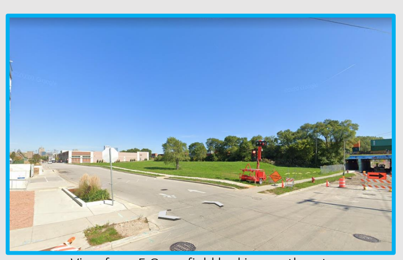
View from E Greenfield looking northeast