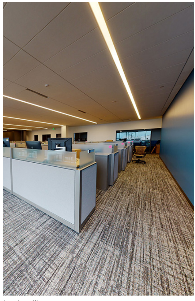
Interior office spaces.