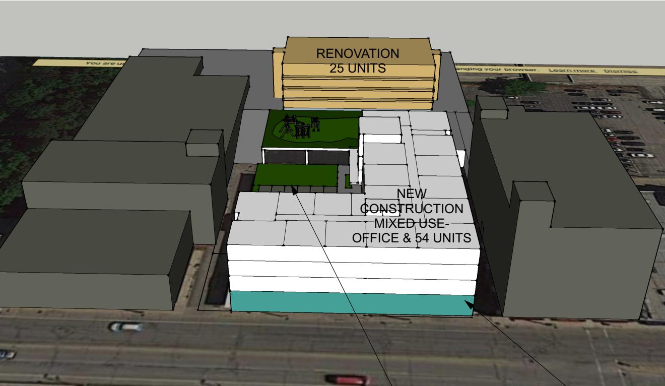
2 A101 VIEW FROM SOUTH