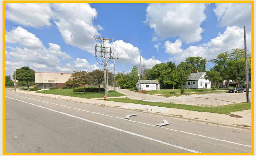
View from W Hopkins looking northeast