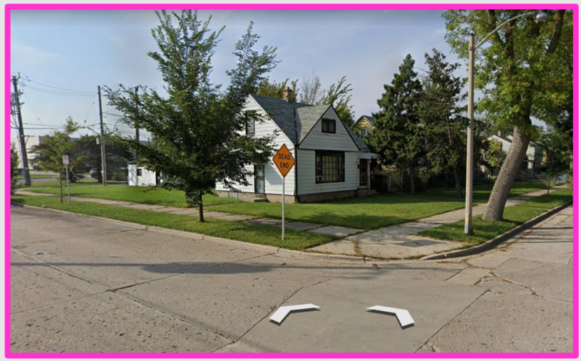
View from W Melvina Place looking northwest