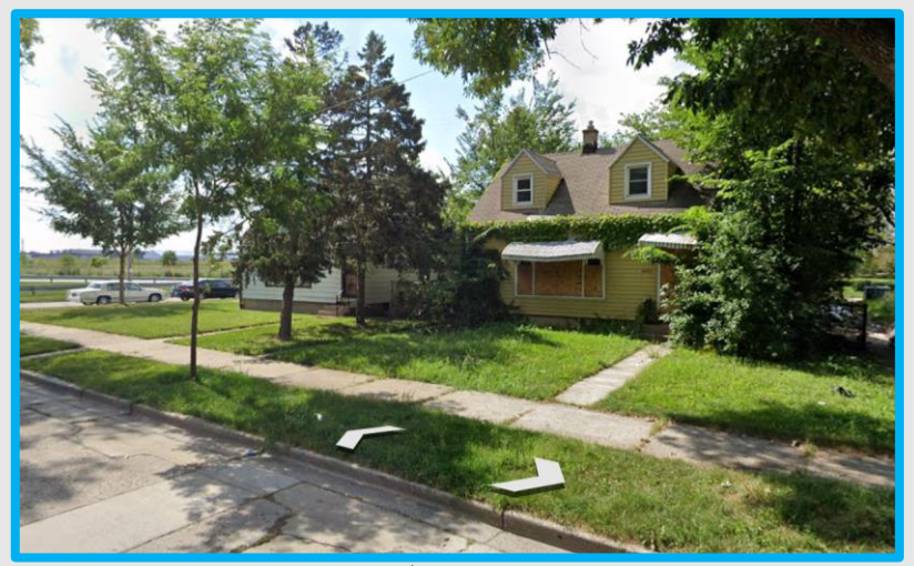
View from N 30<sup>th</sup> St looking southwest