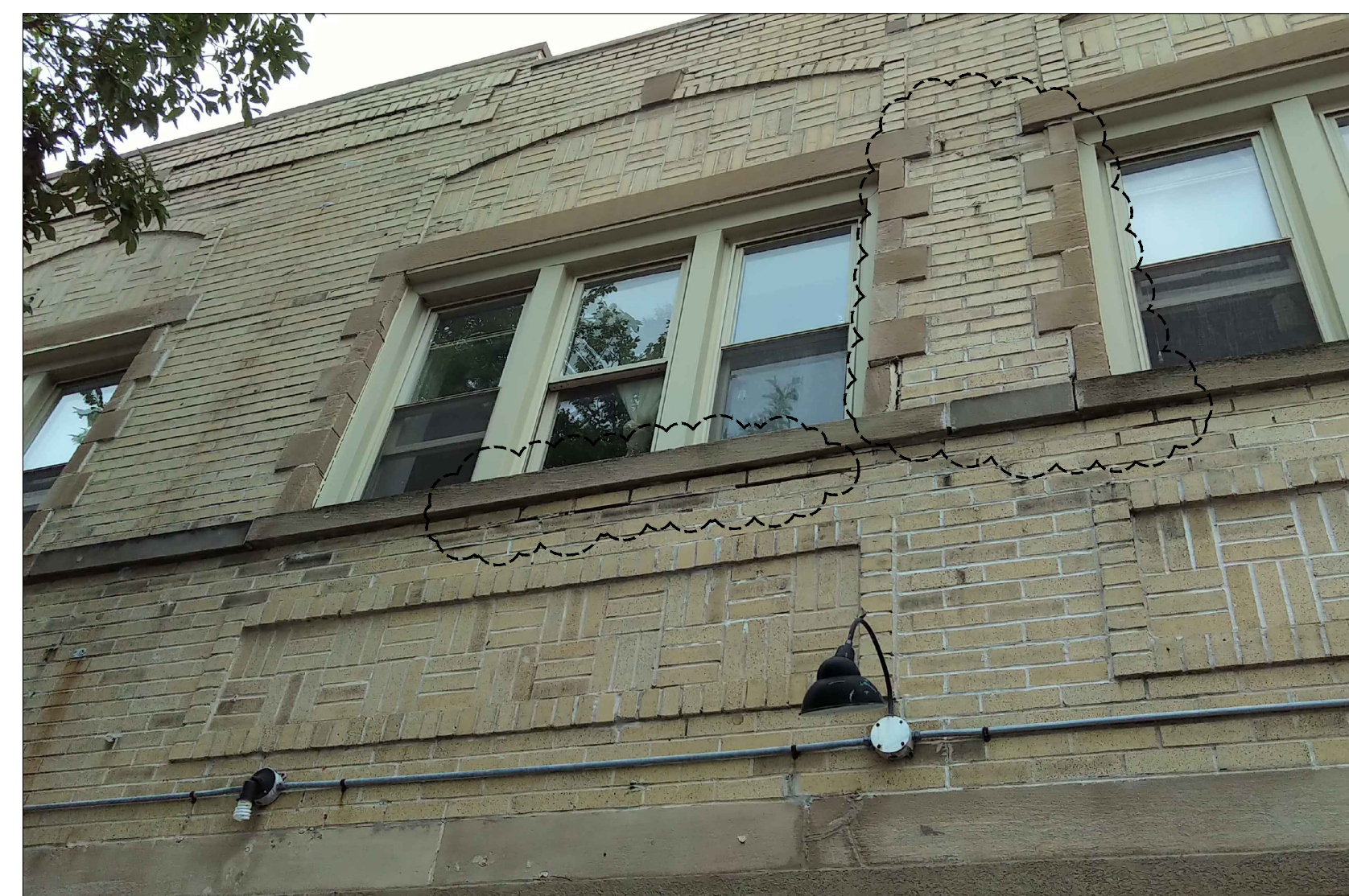
CONSIDERABLE MOVEMENT BETWEEN WINDOWS AND AT THE SILL - MORE OPEN JOINTS