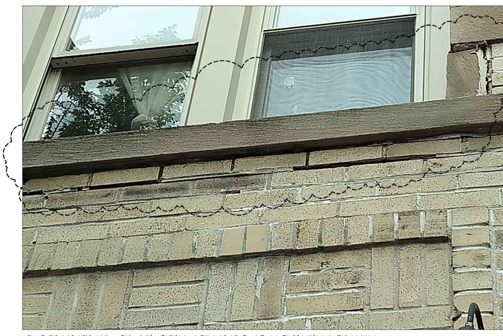
CLOSE UP DETAIL OF THE OPEN JOINTS DO TO MOVEMENT OF WALL