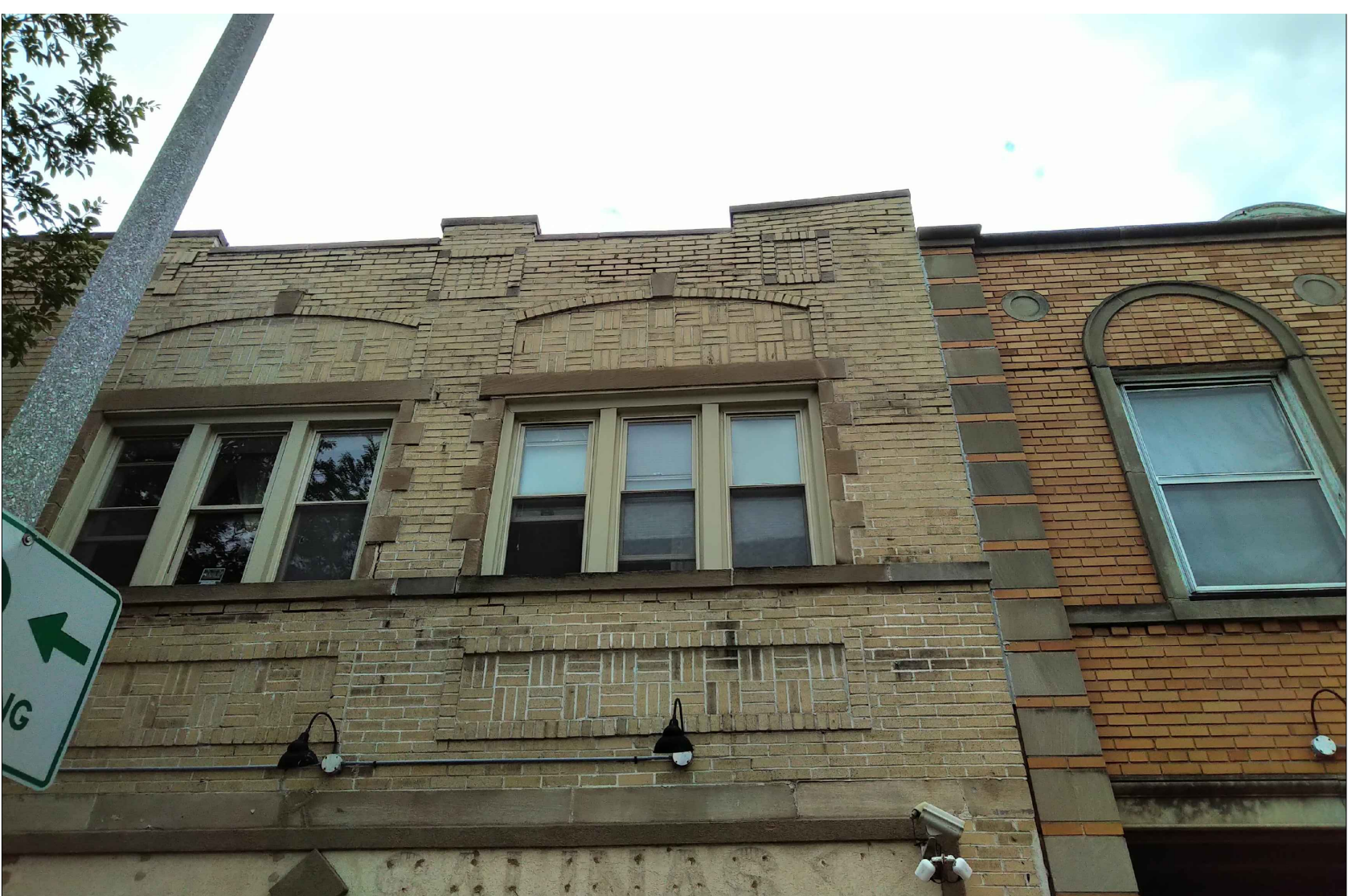
DETAIL ABOVE THE WEST WINDOW - OPEN JOINT AND IMPROPERLY POINTED JOINTS; NOTE THE AREA OF PARAPET MOVEMENT