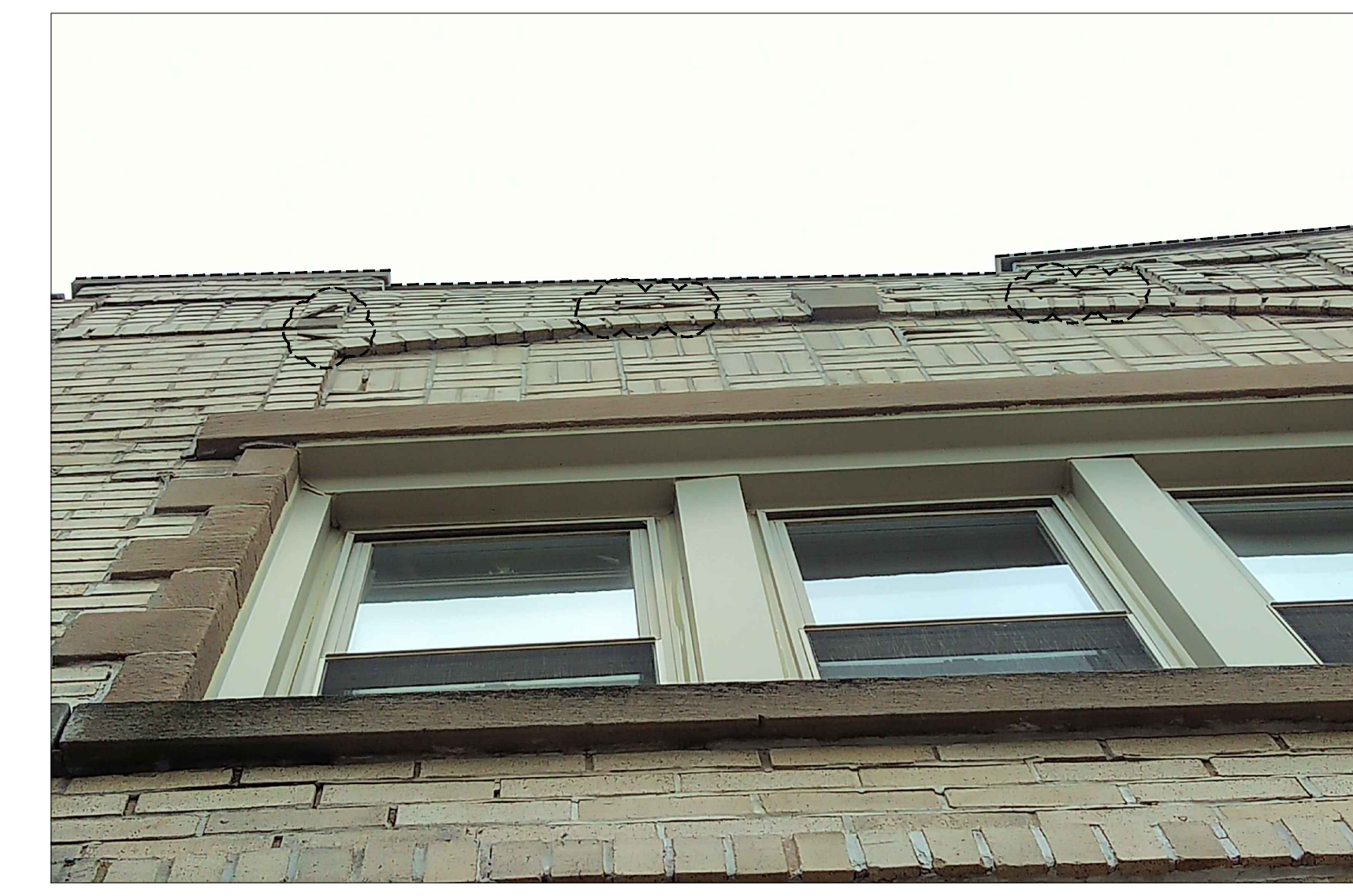
PARAPET ON THE LEFT AND RIGHT ARE AT THE SAME HEIGHT; THERE IS NOTICABLE MOVEMENT AREA OF JOINT MATERIAL BEING PUSHED OUT OF JOINTS.