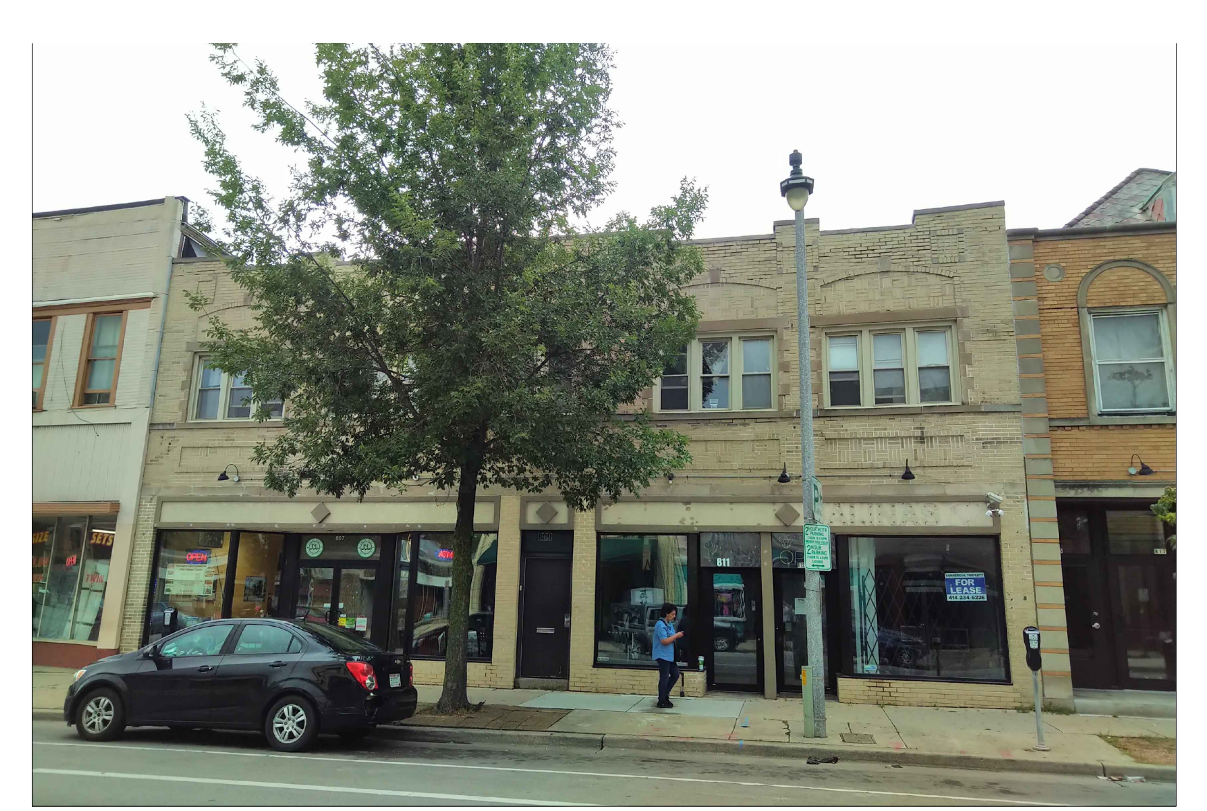
EXISTING NORTH FACADE; ALUMINUM STOREFRONT IS ABOUT 20 YEARS OLD ALONG WITH THE EIFS BANDING.