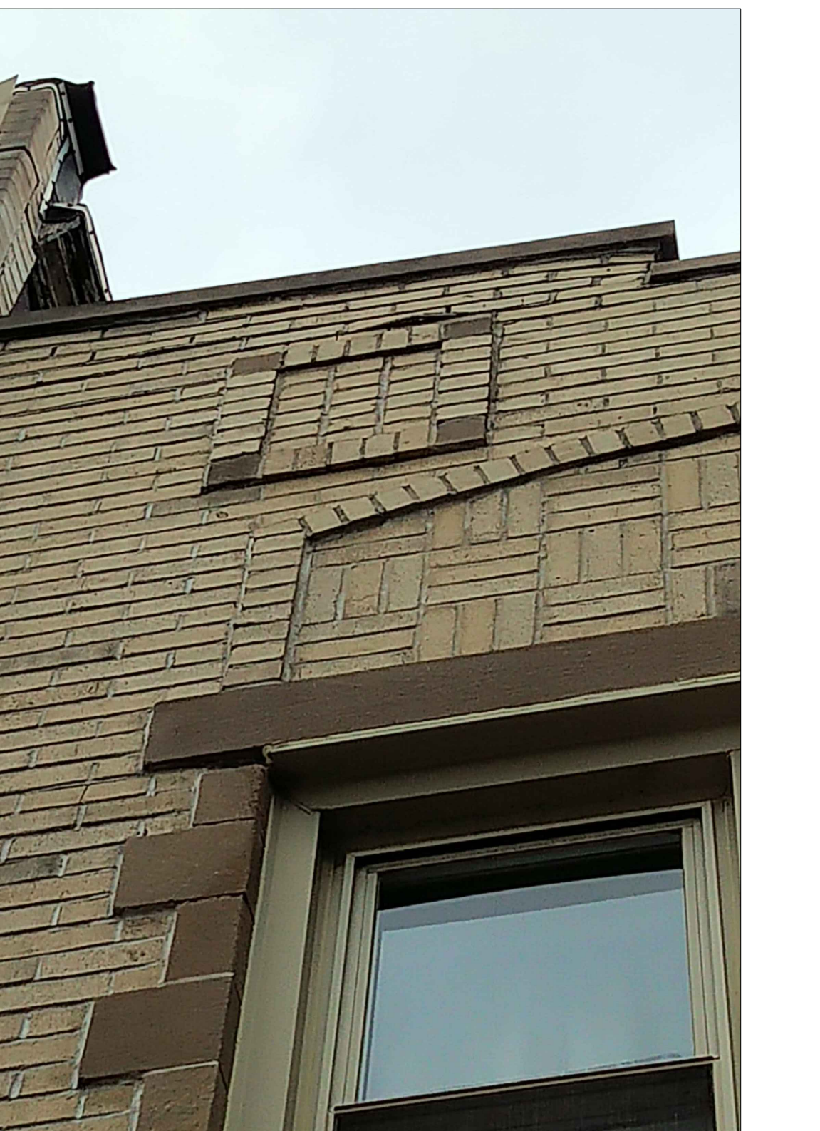
MOVEMENT IS NOTICABLE AT THE PARAPET CONSIDERABLE MOVEMENT AT THE PARAPET BRICK MOVEMENT TO THE RIGHT OF THE WINDOW MORE MORTAR BEING PUSHED OUT OF JOINT