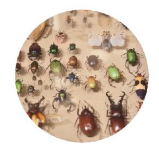
4 million objects & specimens from every WI County to deep in space