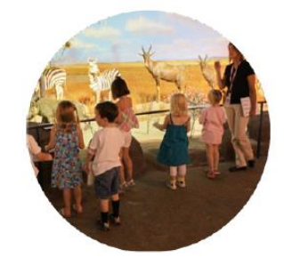
Field Trips from 44 WI counties every year