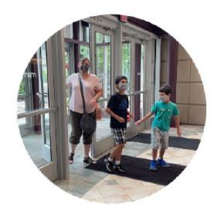
500,000+ visitors every year