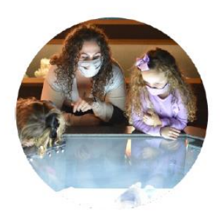
150,000 kids inspired annually