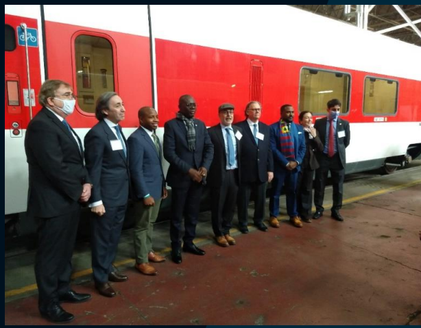
Visit from Governor Babajide Sanwo-Olu of Lagos, Nigeria on January 18, 2022