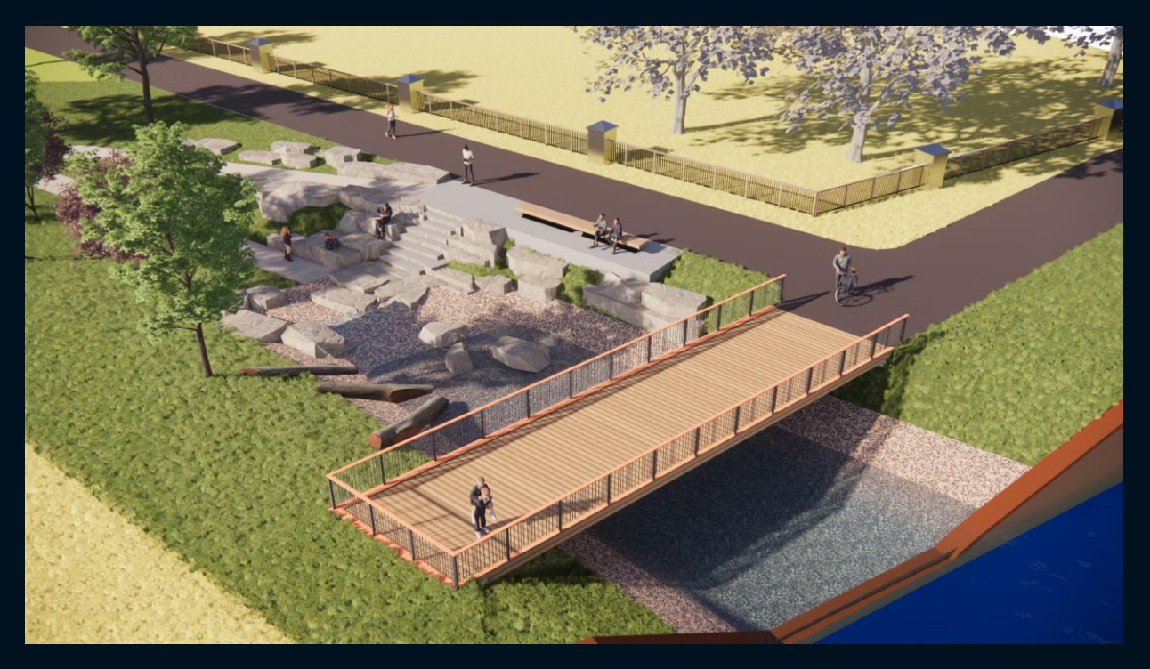
The Node, rendering by The Smith Group, Inc.