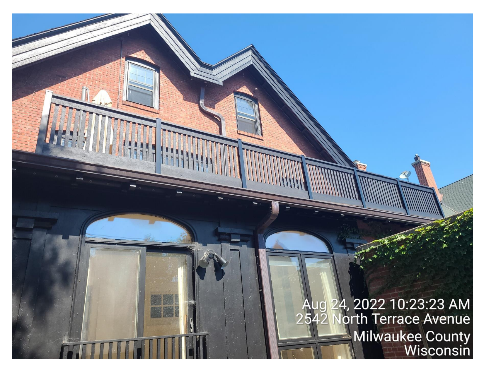
Finished new railing as photographed by DNS inspector. Approved as built.