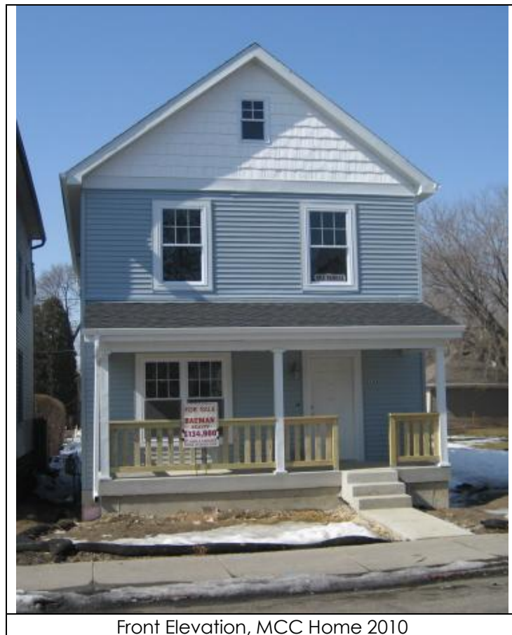
Front Elevation, MCC Home 2010

Four single-family homes to be sold to owner-occupants upon completion. Homes will be two and one-half stories, 1,400 square feet with three bedrooms and two bathrooms. The home design is compatible with the neighborhood in terms of scale and has a front porch and two-car detached garage with alley access. The construction costs will be approximately $170,000 and the homes will be marketed for $134,900 to families with incomes at or below 80 percent of the County Median Income. MCC homes are underwritten with CDBG Home funds and private financing.