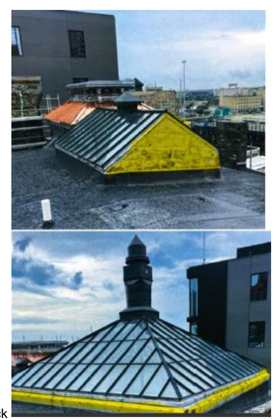
Areas indicated in yellow to be painted black