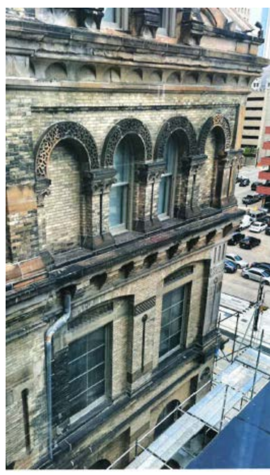
Windows to be painted

Clock tower's wood ceiling to be painted Baja Dunes