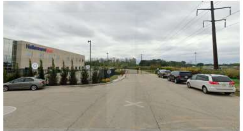
Street View Looking East from Proposed Guard Shack