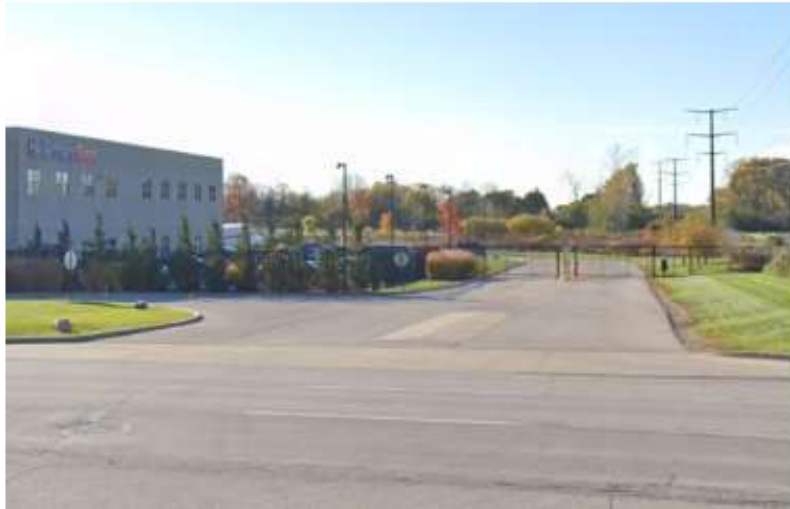
Good Hope Street View Looking South