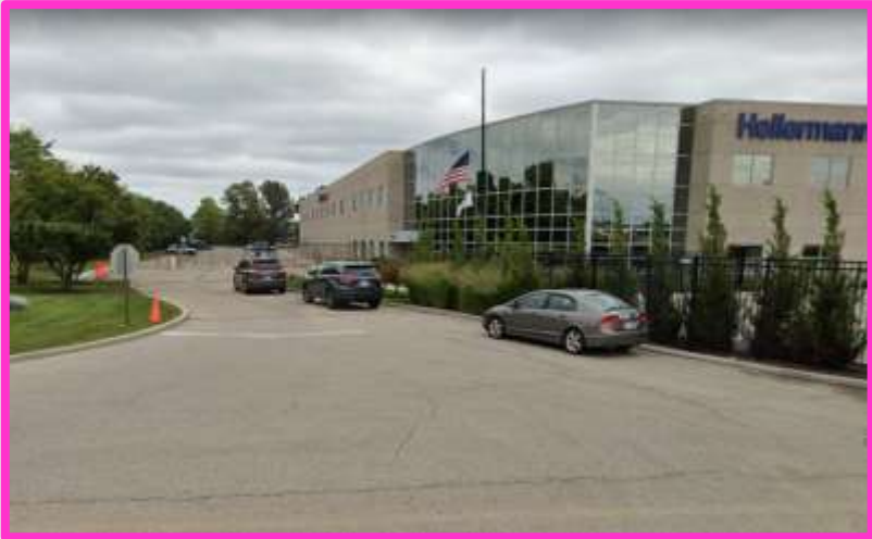
View from entry drive looking east