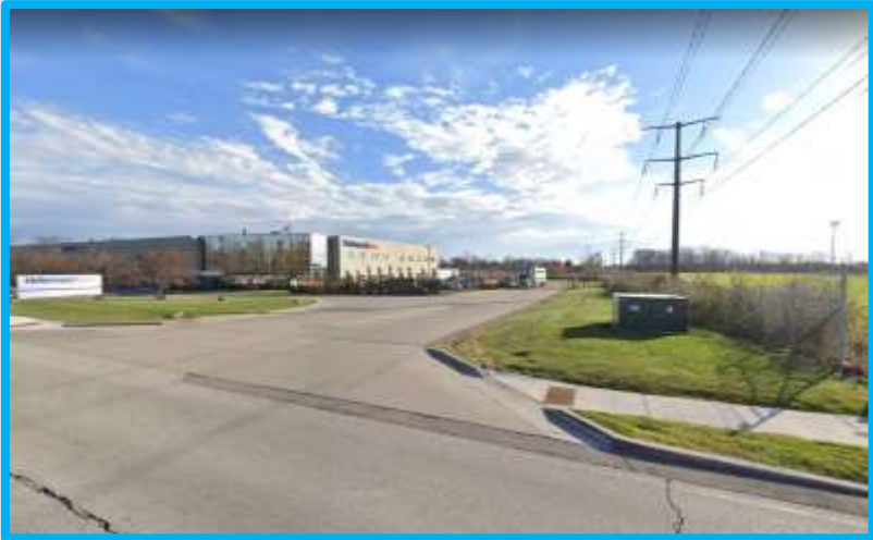
View from Good Hope Rd looking southeast at entry drive