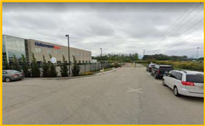
View from entry drive looking south