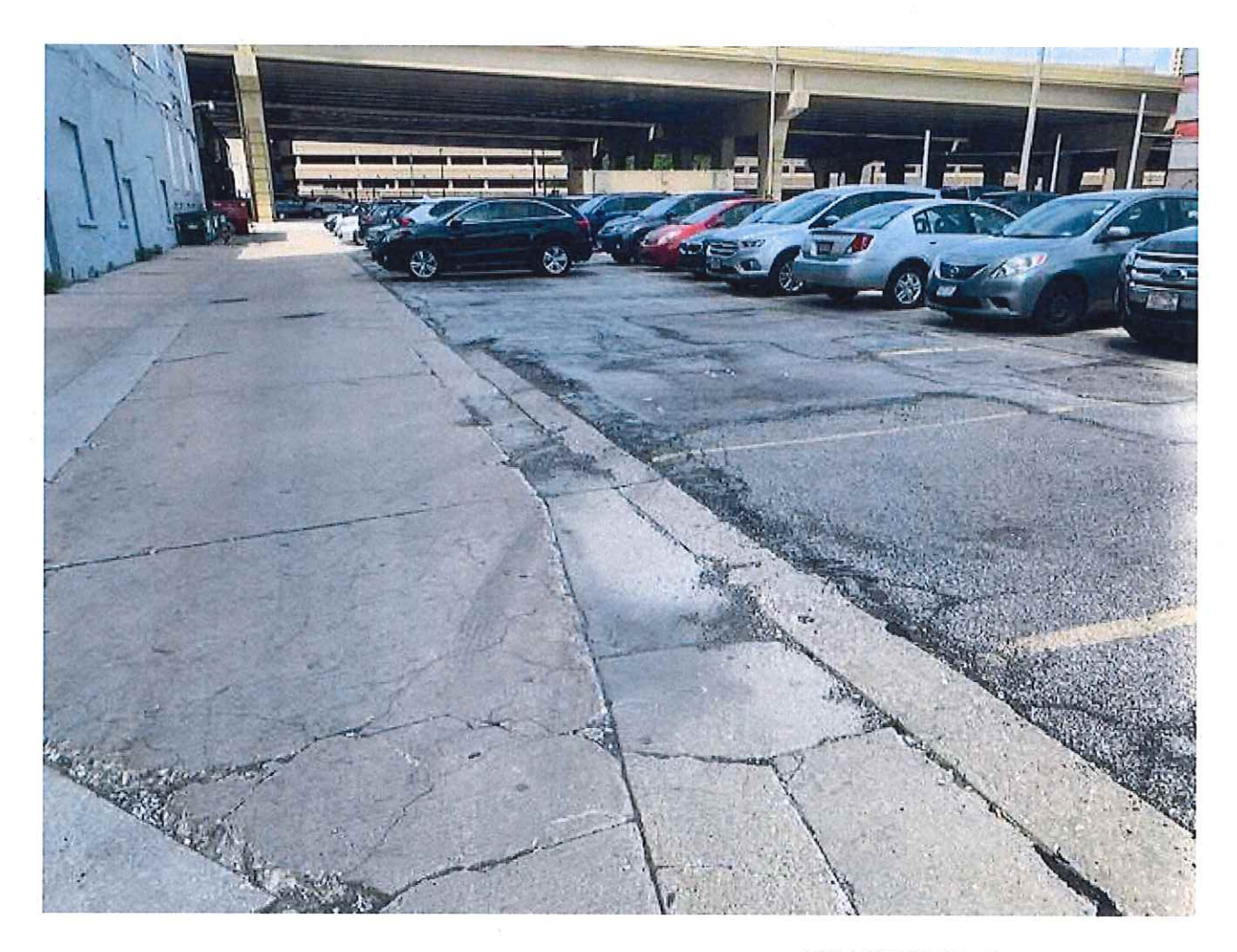
Please add these to the license file