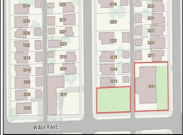
City commercial property southeast view