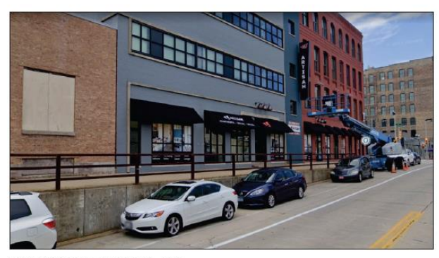
EXISTING NORTH ELEV. VIEW - NTS