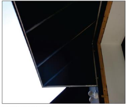
EXISTING AWNING FRAMEWORK & CLIPS