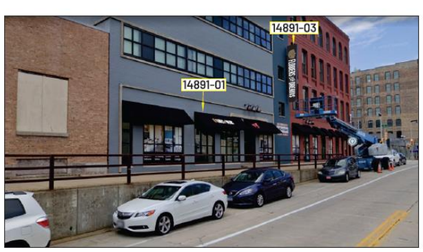
PROPOSED NORTH ELEV, VIEW - NTS