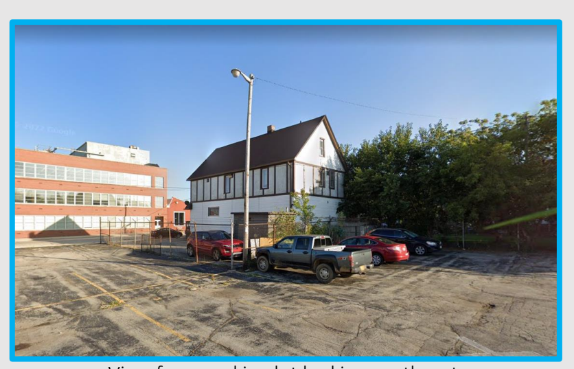
View from parking lot looking southeast