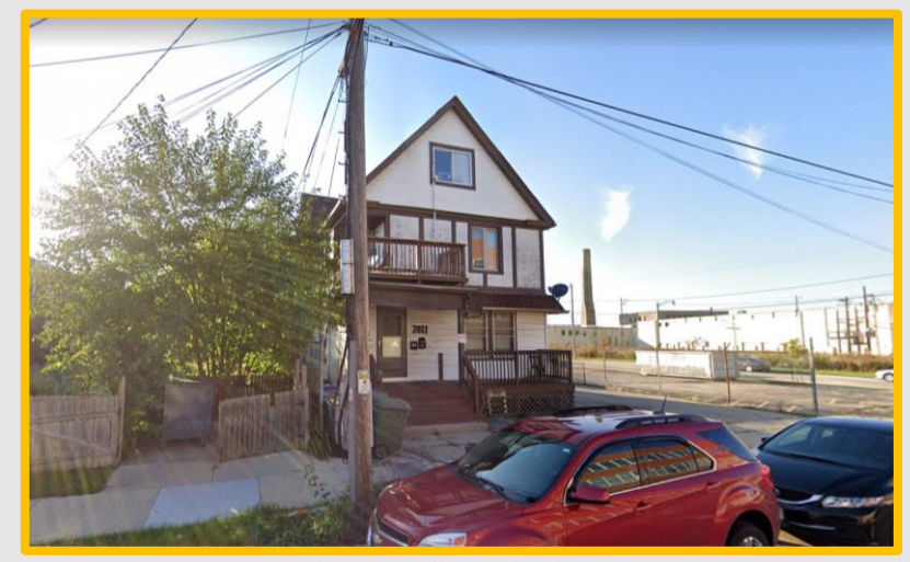
View from S Allis St looking west