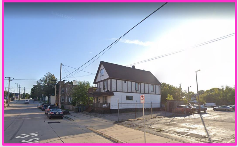
View from S Allis St looking southwest