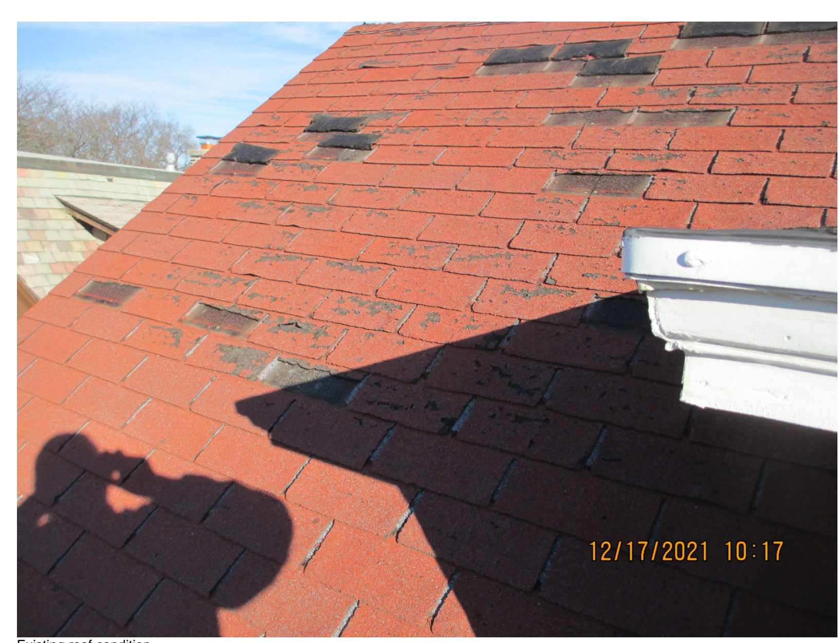
Existing roof condition