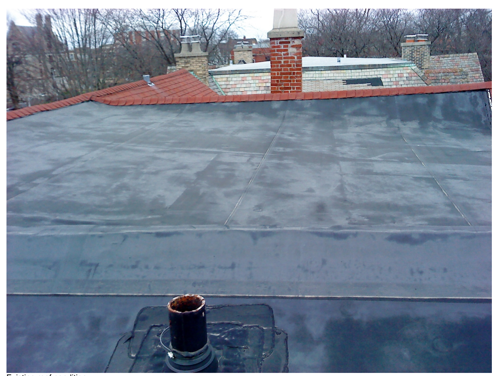
Existing roof condition