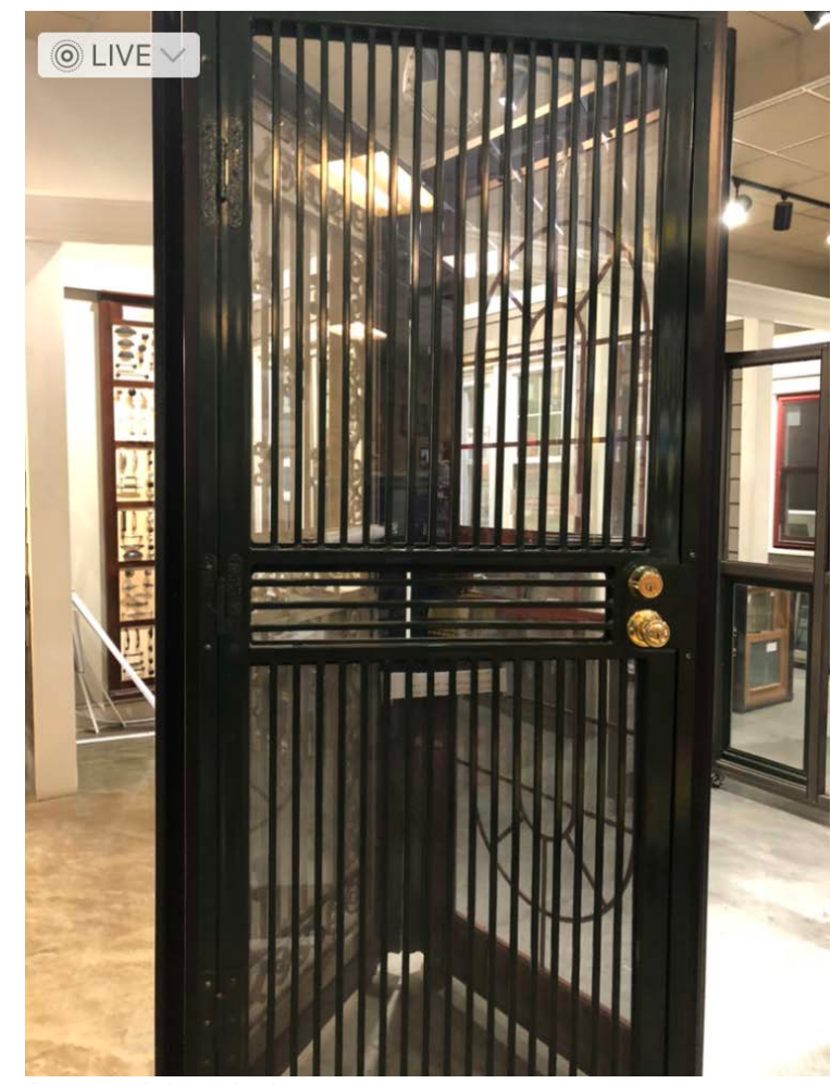
Approved door design