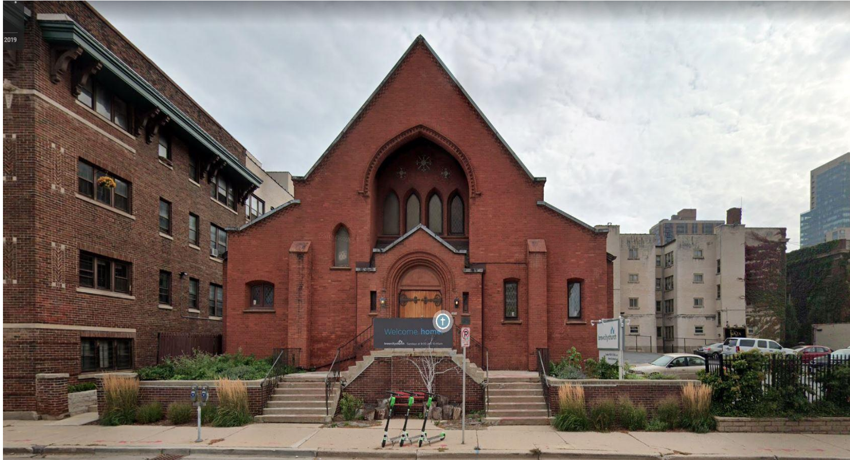
1036 N. Van Buren Sixth Church of Christ, Scientist now Brew City Church