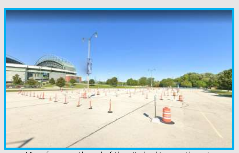
View from south end of the site looking northwest