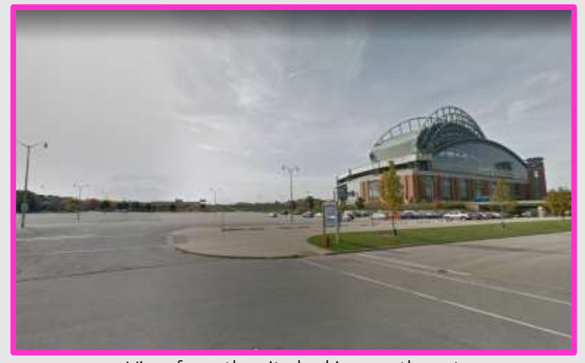
View from the site looking southwest