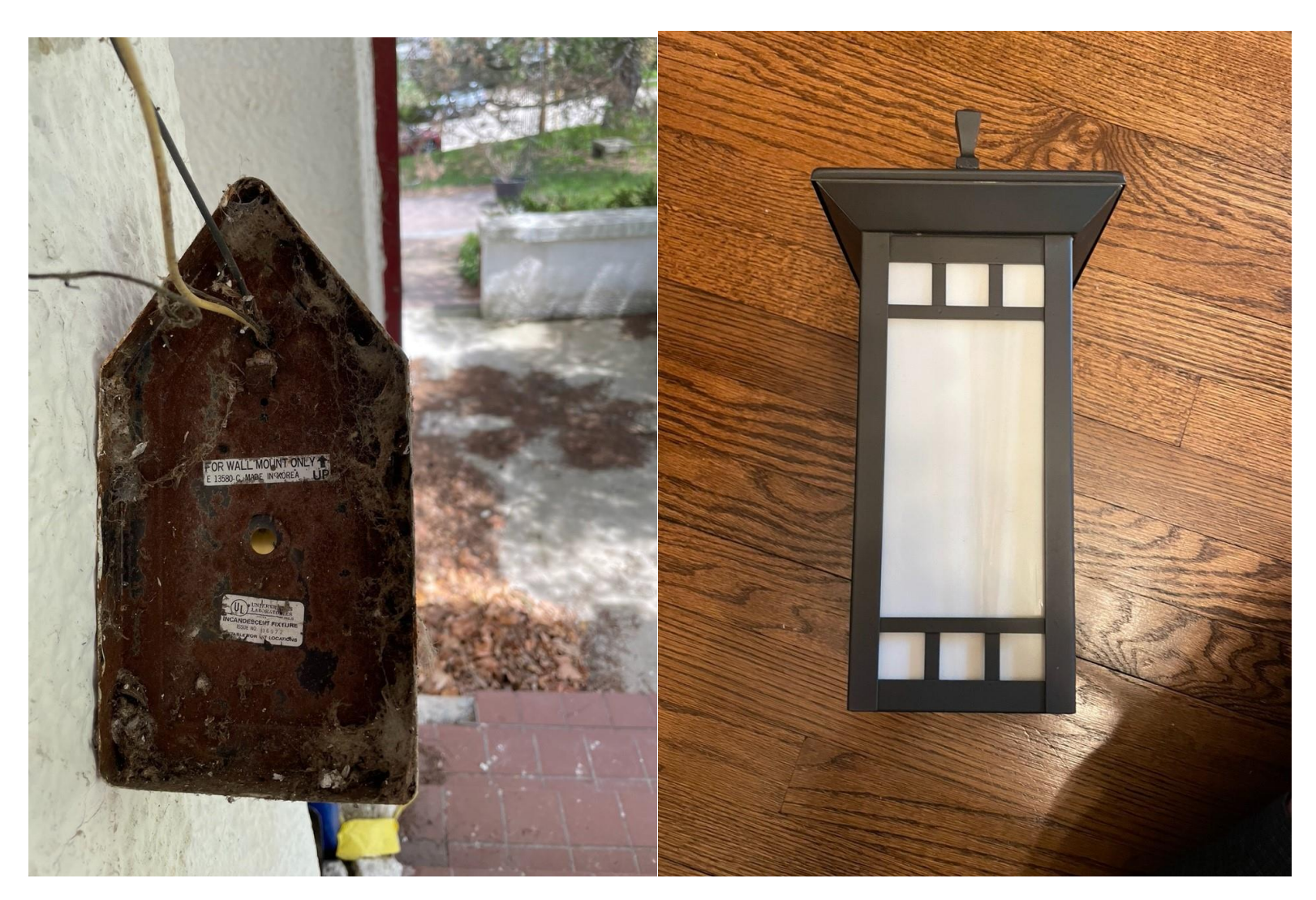
Current condition of the sconces