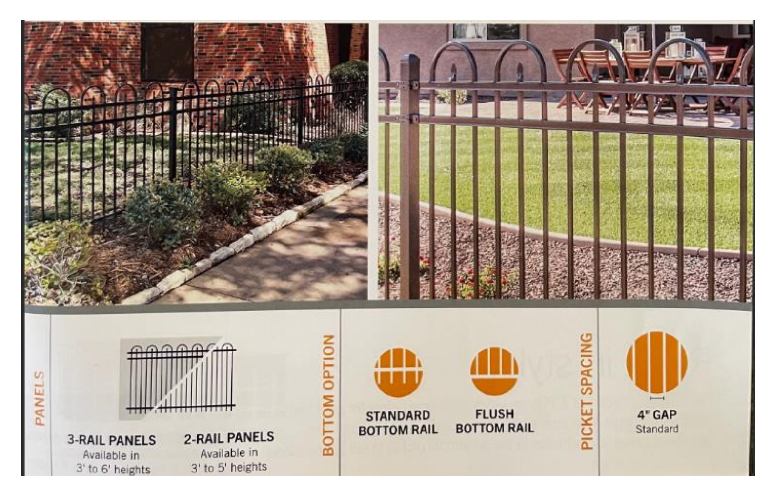
HPC has no position on bottom rail. Owner may choose either bottom rail.