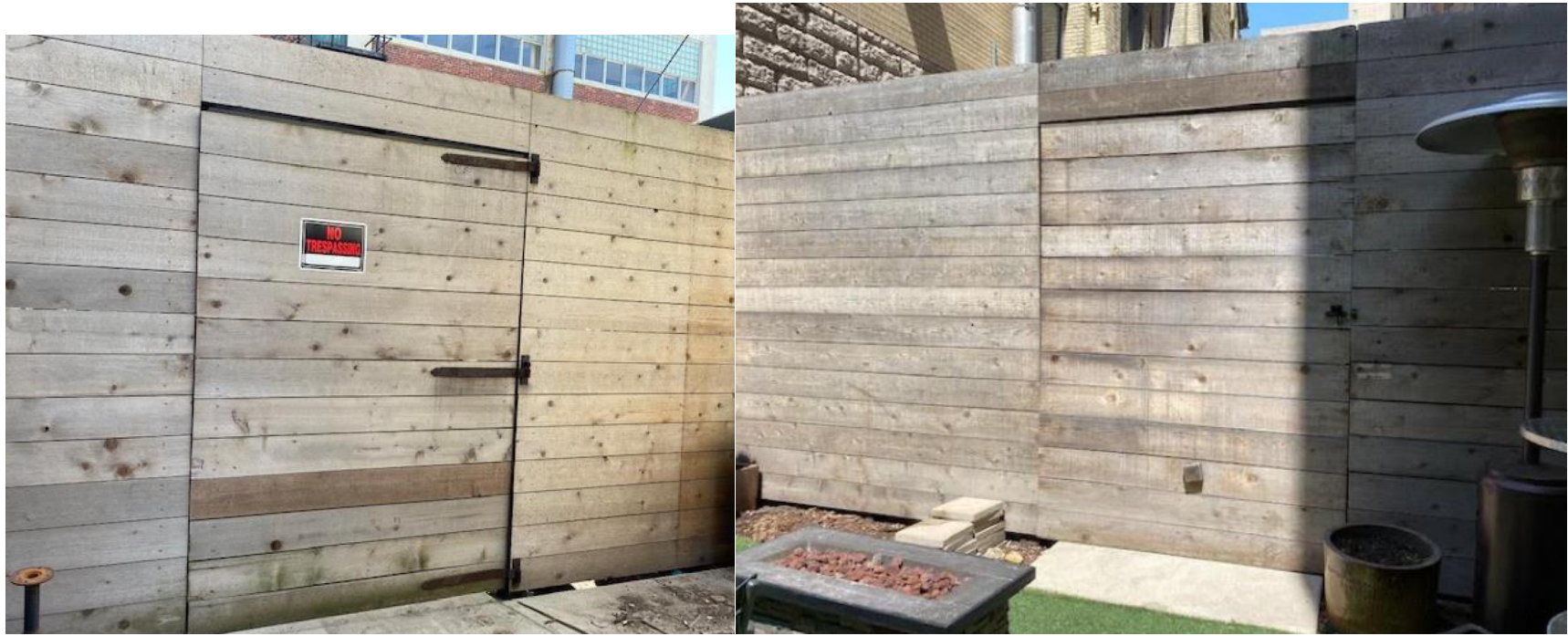
Existing fence and gate that will be replicated