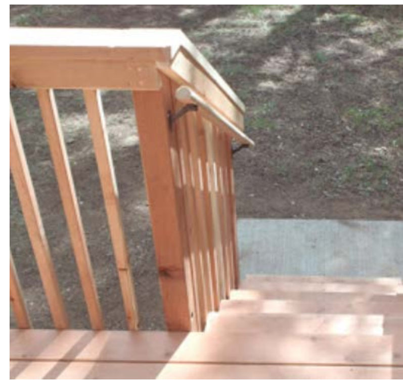
UNACCEPTABLE GRASPABLE RAIL