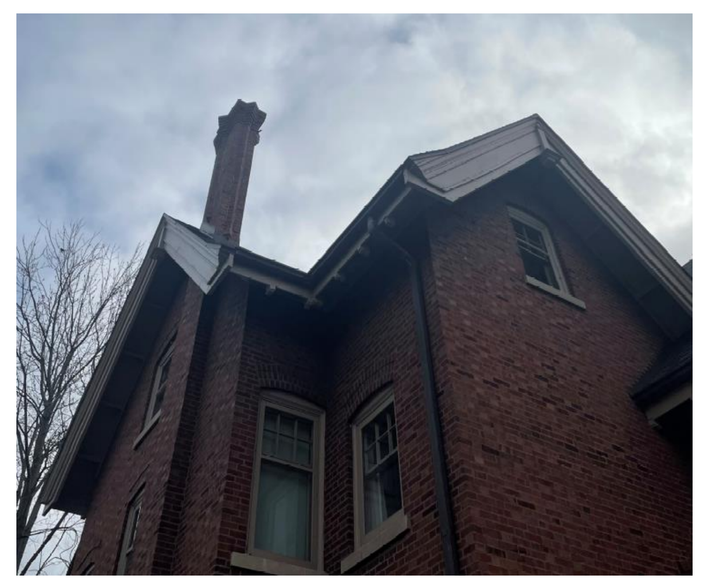
The main chimney will be re-built to match the top of the west chimney