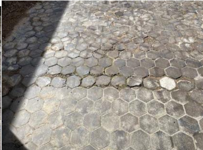
Examples of driveway tile deterioration