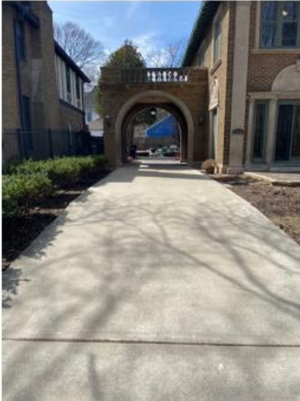
Existing Concrete Driveway: Facing West from Front of house