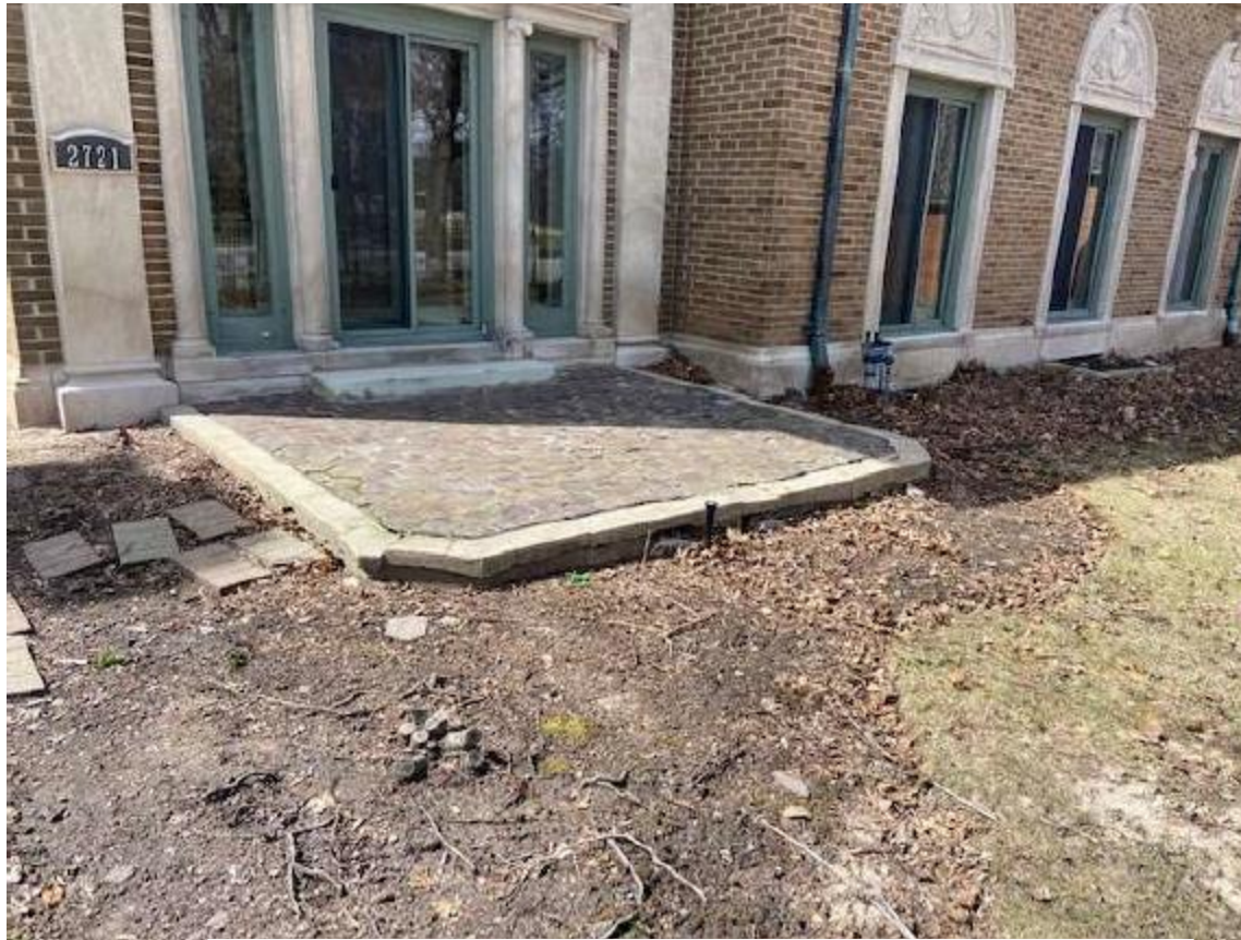
Front Patio and pavers leading to the driveway