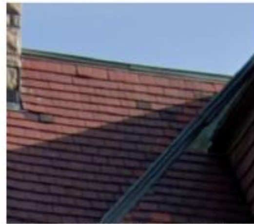
REPLACE NECESSARY ROOF TILES AND COPPER WORK FOR ROOF TO MATCH EXISTING