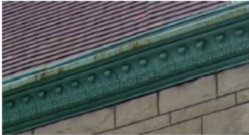
FIX / BEND / PATCH CORNICES, THEN PAINT PATCHES TO EITHER MATCH EXISTING GREEN COLOR OF COPPER OR MATCH EXISTING BROWN COLOR OF COPPER DOWNSPOUT