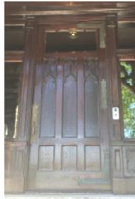
STRIP AND RESTAIN FRONT DOOR TO MATCH EXISTING