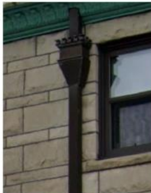
BROWN COLOR OF COPPER