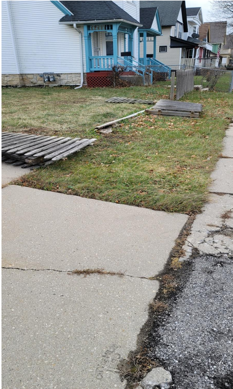
Current condition and location of the applicant's fence