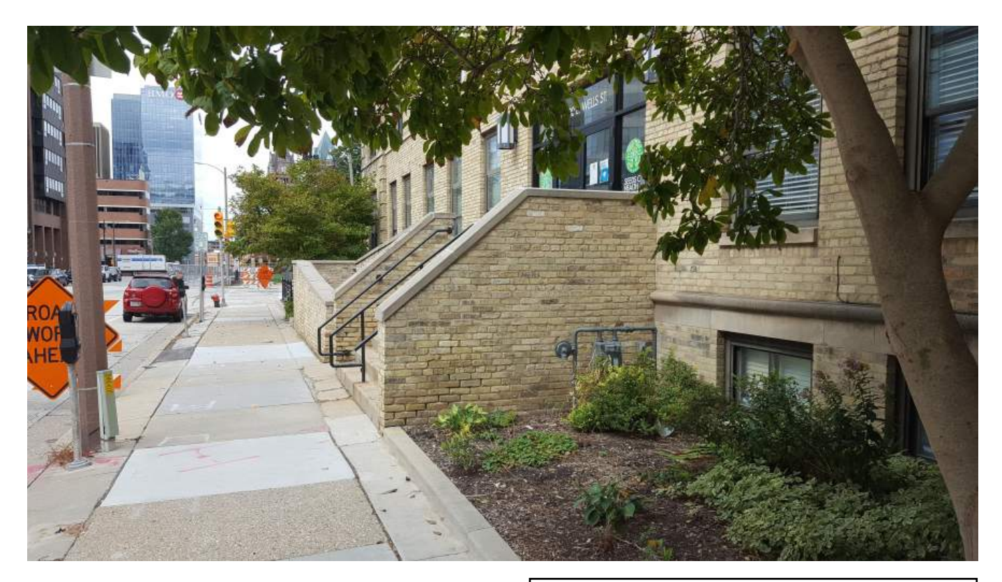
Exhibit C View of east facade of ramp and stair. Existing gas meter to remain.