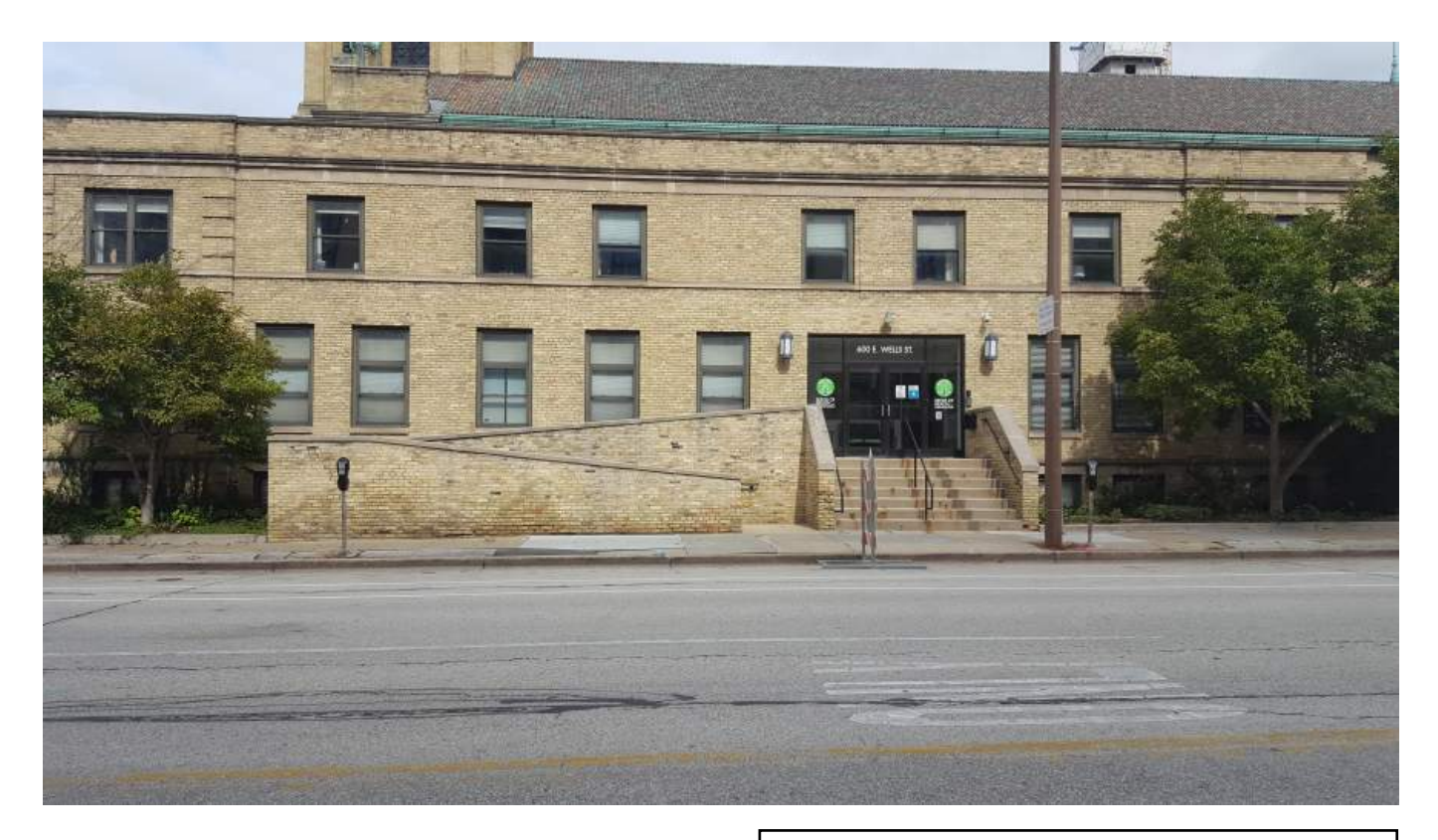
Exhibit E Alternate view of south facade along E. Wells Ave.