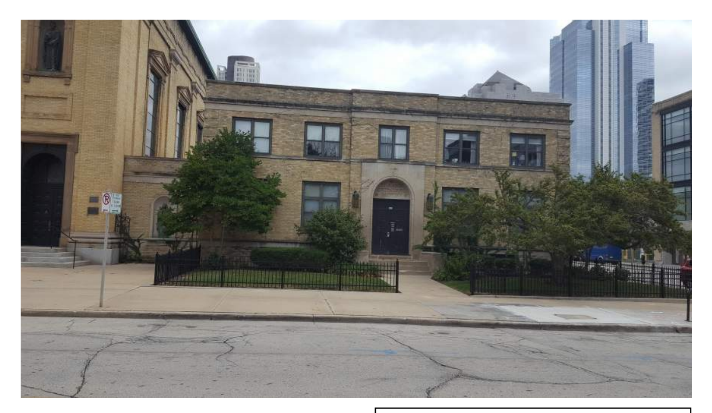
Exhibit B View of west facade along N. Jackson St. Ramp and stair are generally obscured by trees.