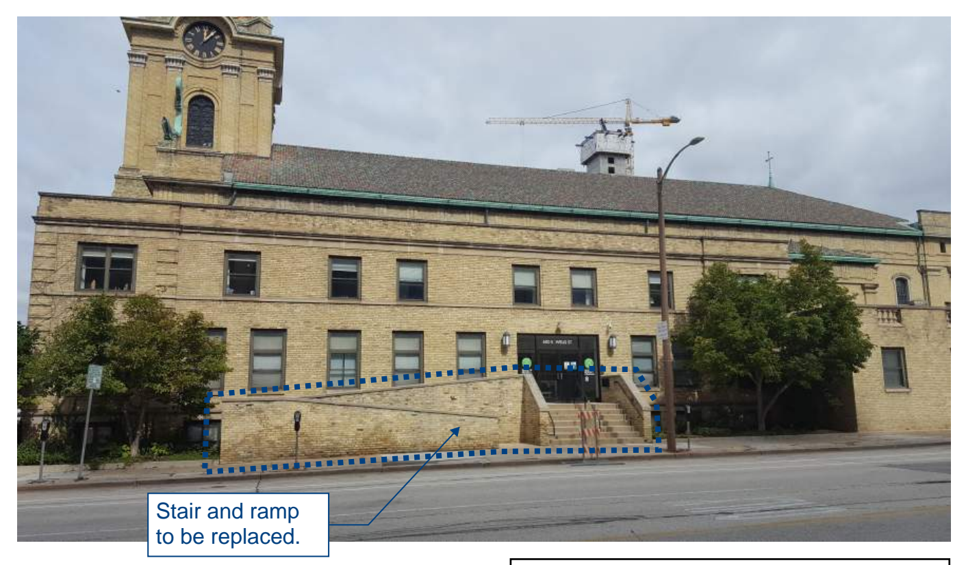
Exhibit A View of south facade along E. Wells St.