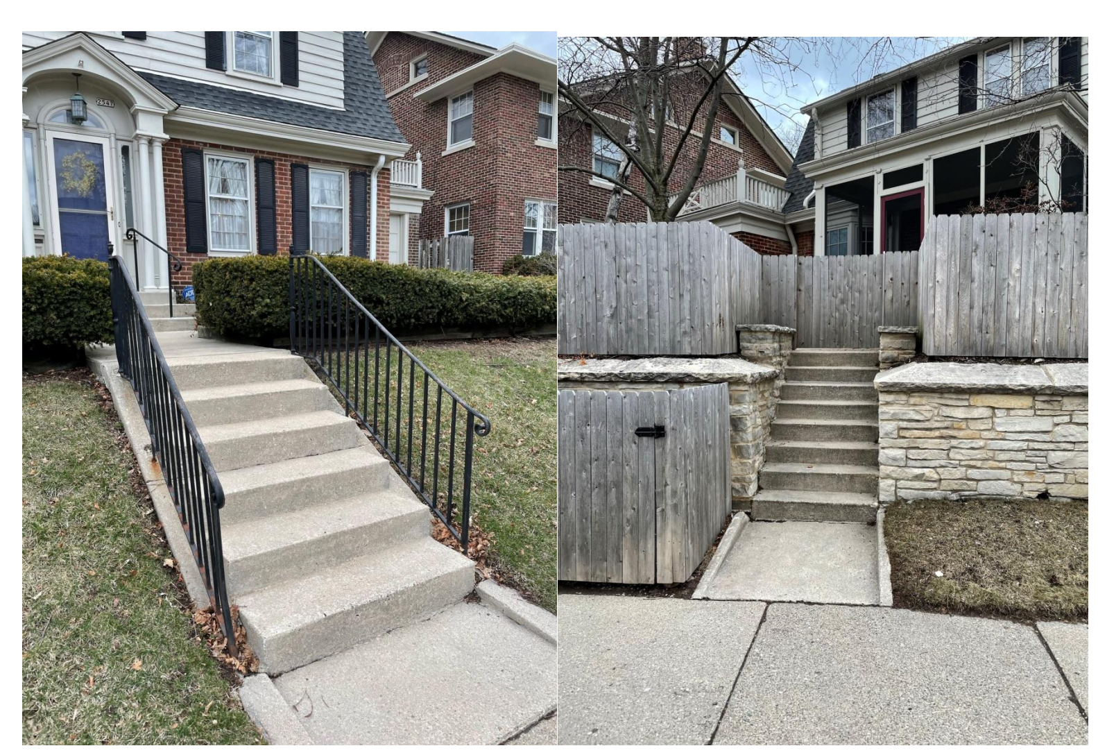
Stairs at the front of the property