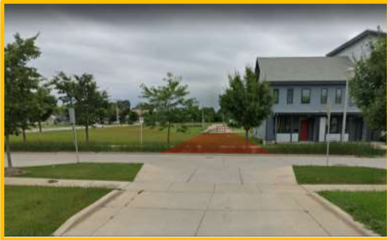
View from alley looking south