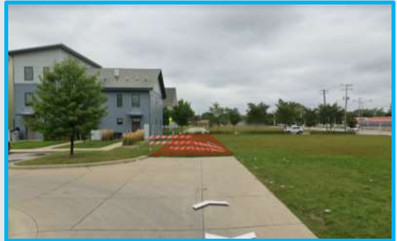
View from alley looking north