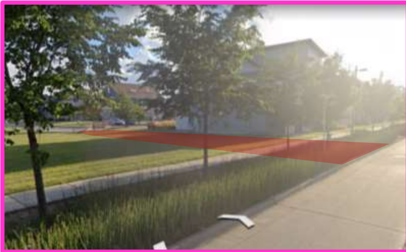
View from W Sheridan Ave looking southwest