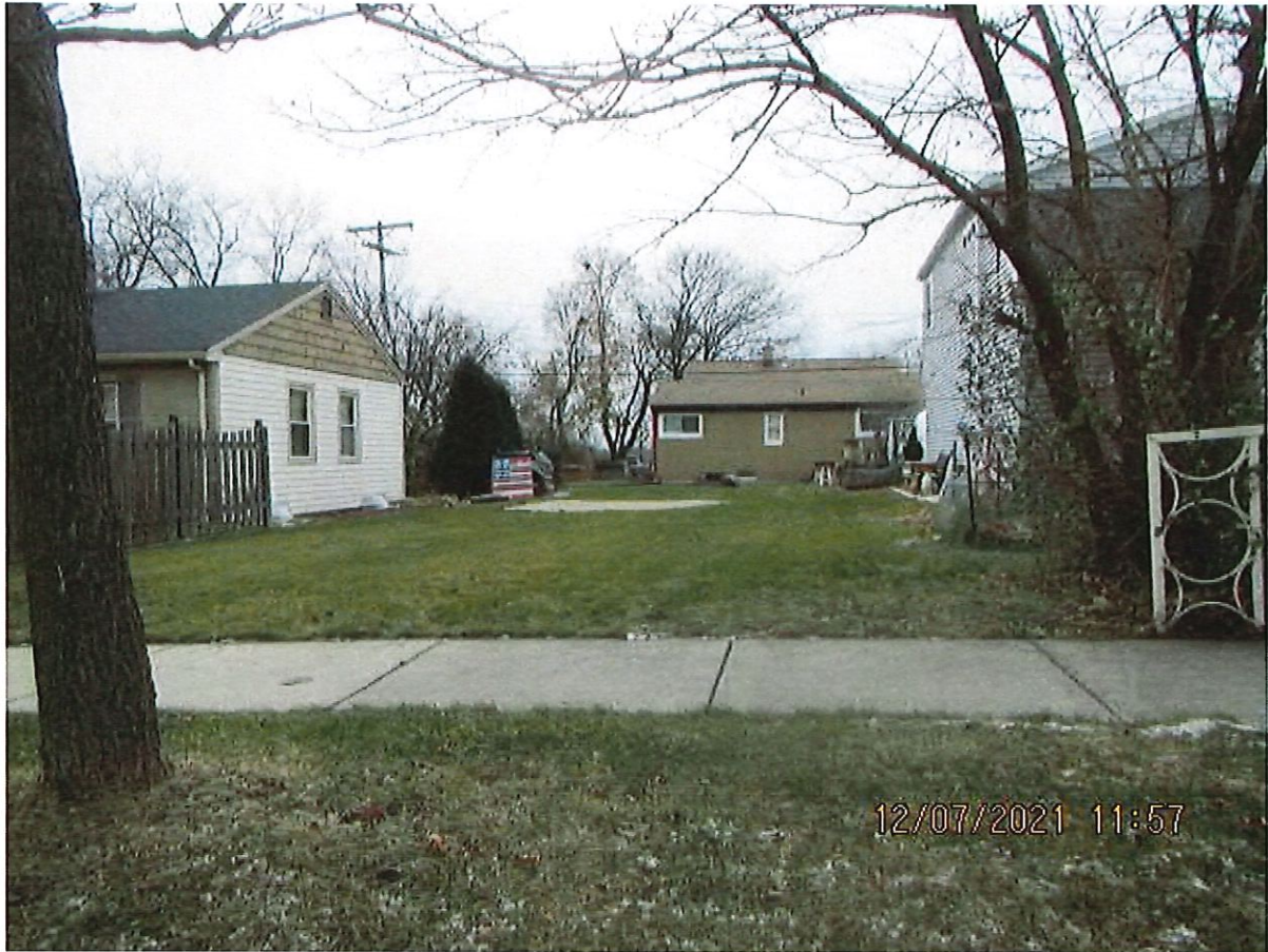
9319 W Alder