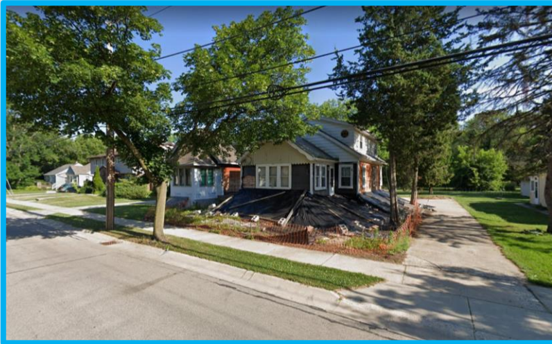
View from West Lawn Ave looking southeast