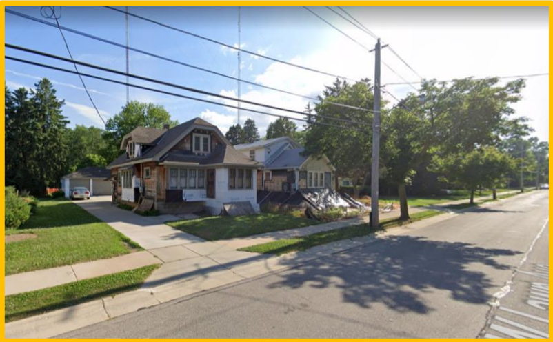
View from West Lawn Ave looking southwest