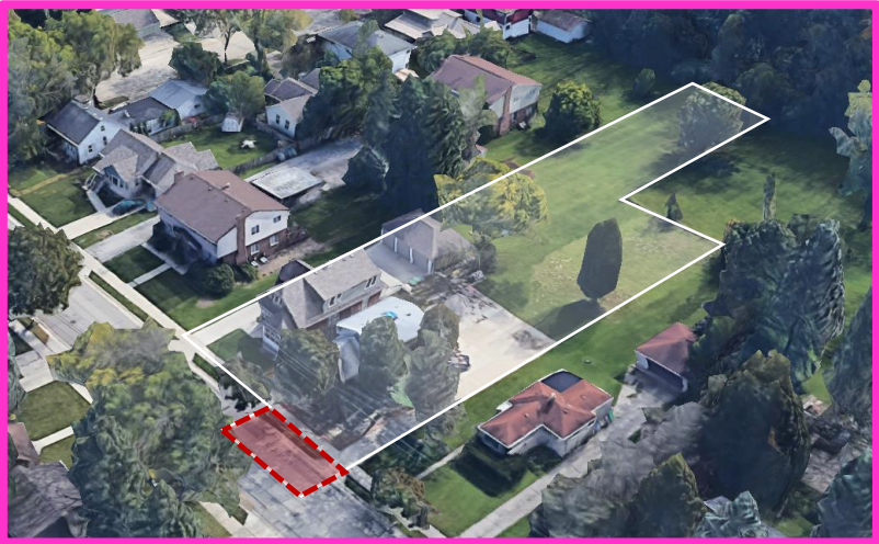
Aerial view looking southeast