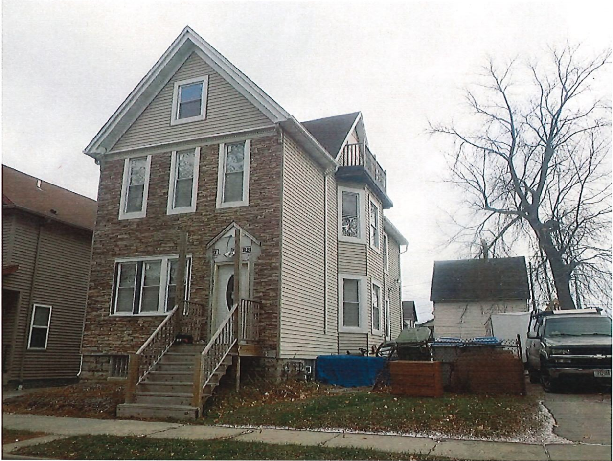
1832 North 18 th Street