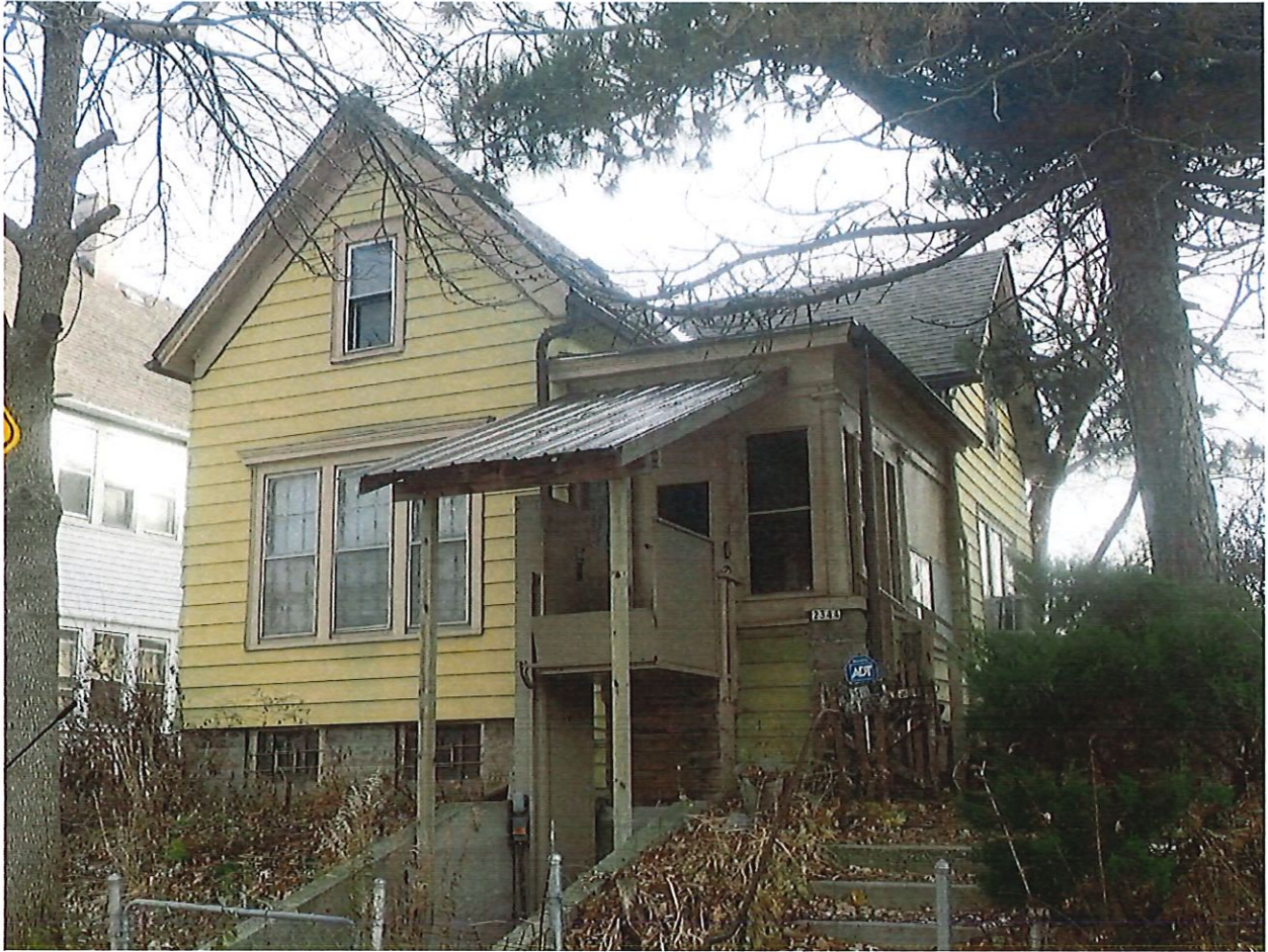
2344 North 5 th Street