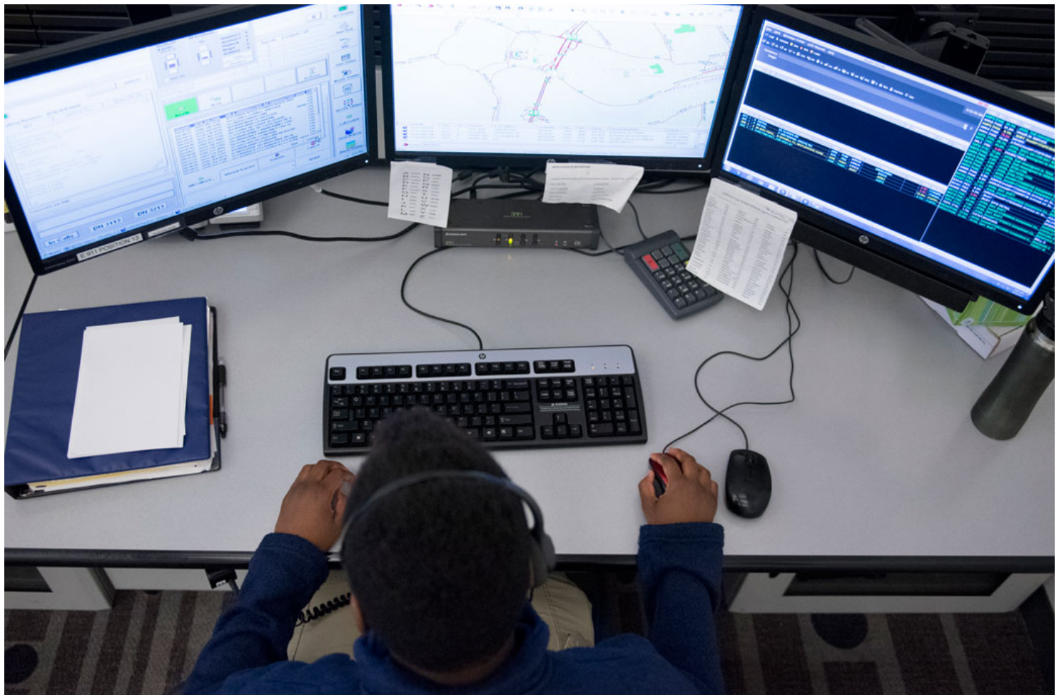
An employee answers calls at the Essex County Regional Communications Center in Middleton, Massachusetts, on June 22, 2017.