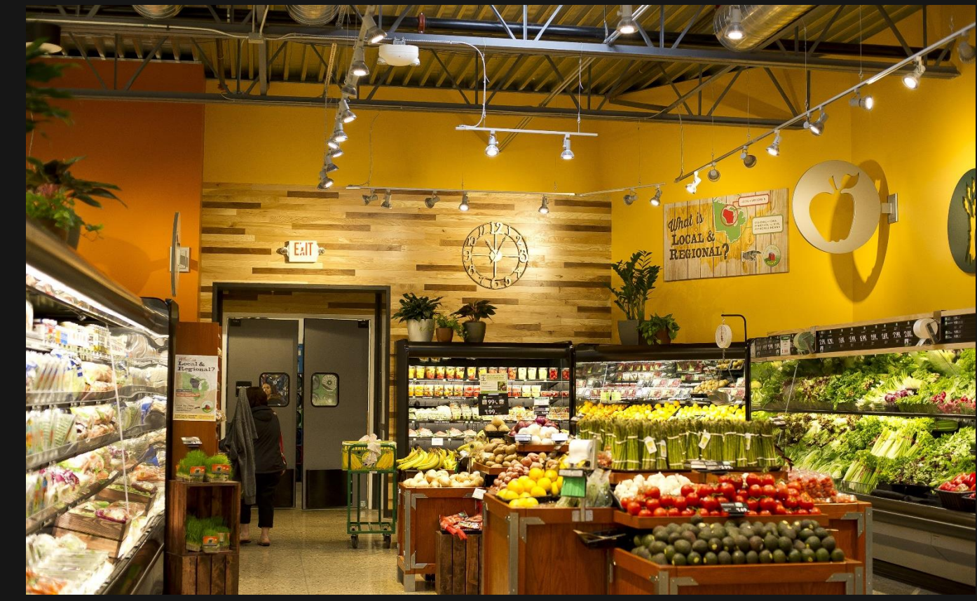
Outpost Natural Foods - Mequon