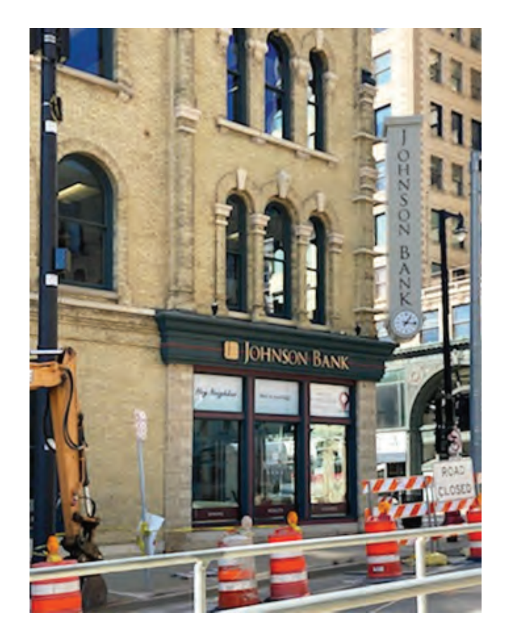
Existing double face sign [opposite side is identical]