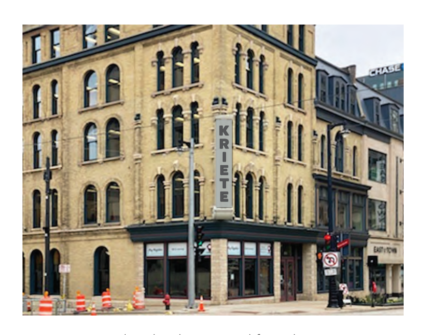
Rendered with proposed face change