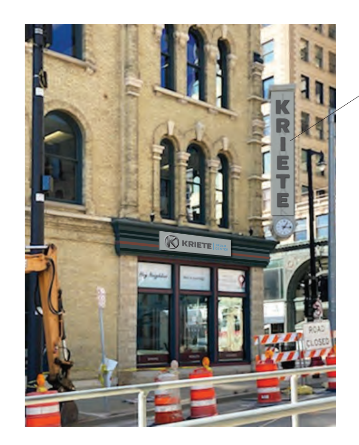
Rendered with proposed signage replacement