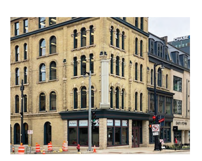
Existing blank face