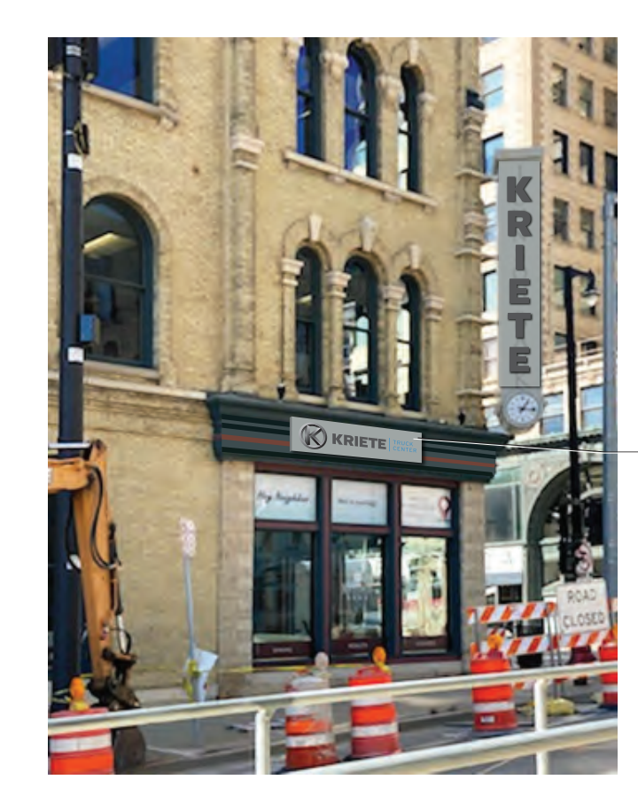
Rendered with proposed face change