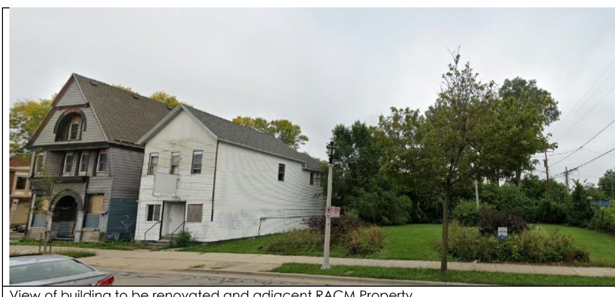
View of building to be renovated and adjacent RACM Property

Developer intends to complete construction of a one story commercial space and associated parking and landscaping. One Story commercial space will consist of gallery and office space. The existing duplex at 507 West North Avenue will be renovated into office space and residential. The estimated total development cost for the project is approximately $1,500,000.00