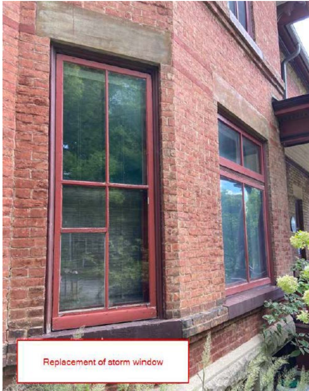
Replacement of storm window