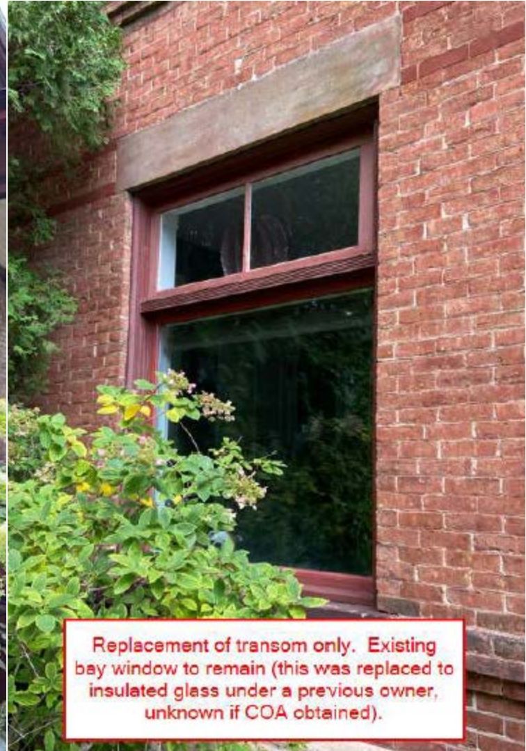
Replacement of transom only. Existing bay window to remain (this was replaced to insulated glass under a previous owner, unknown if COA obtained).