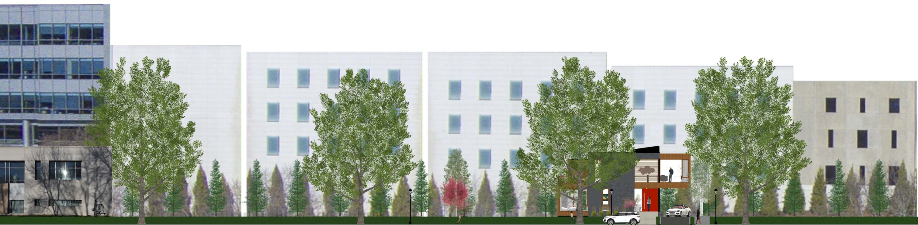
LOOKING WEST WITH CONTEXT