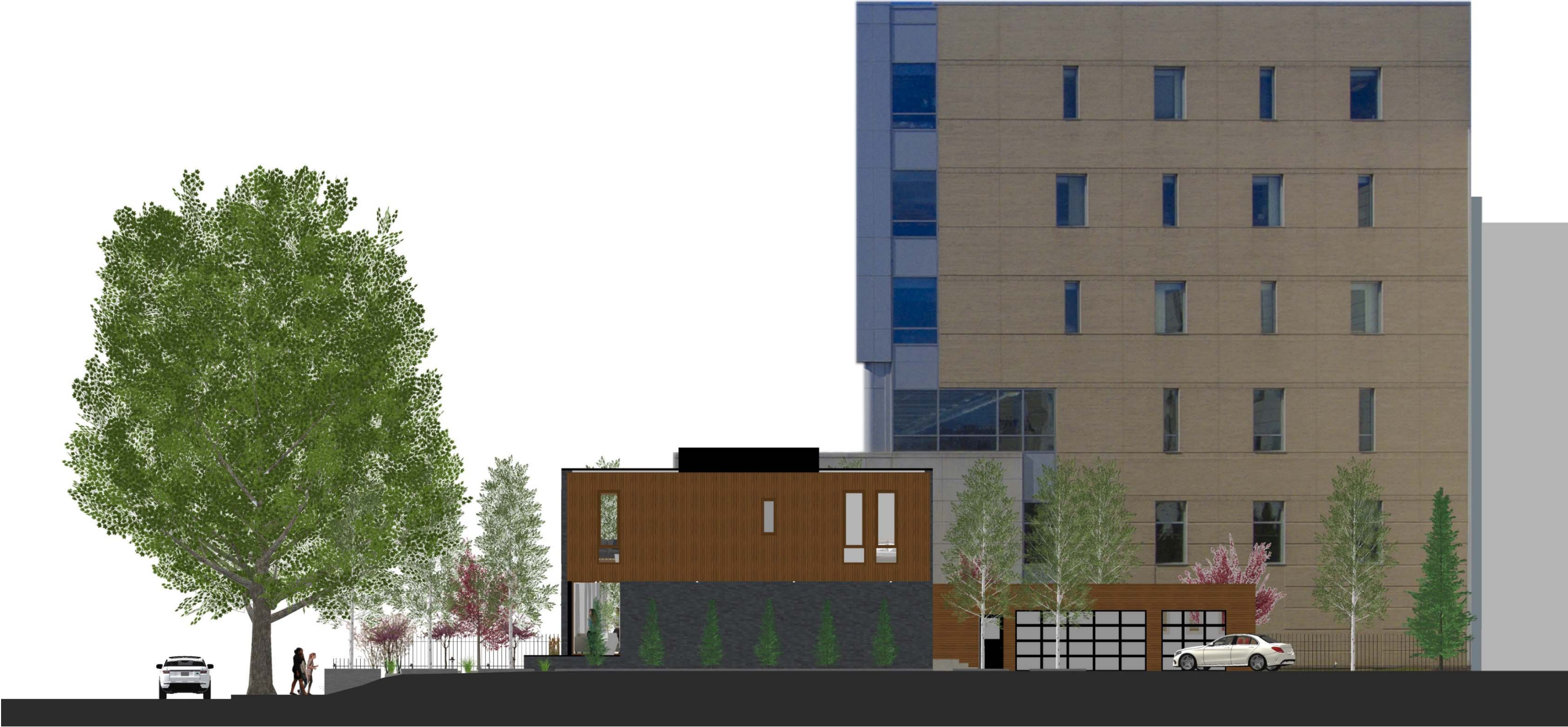
LOOKING SOUTH WITH CONTEXT