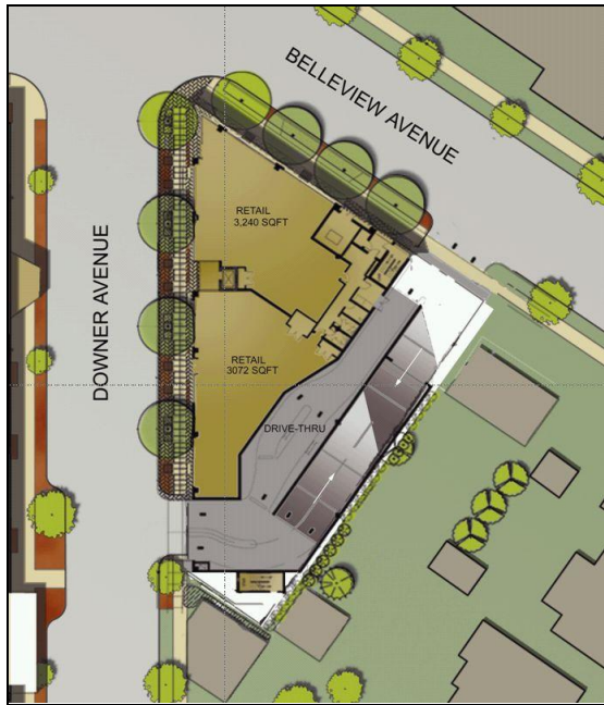
Preliminary Site Plan

wagon will be relocated to an agreed upon location.